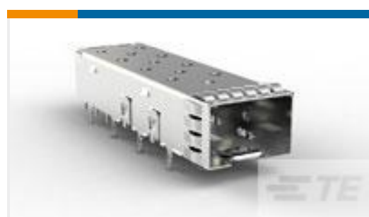
TE Part #2007198-1 SFP+ 1x1 Cage Assembly, Press-