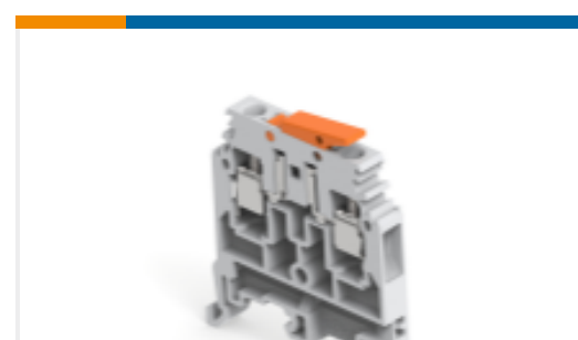
TE Part #1SNA115987R0100 M4/6.SNBT