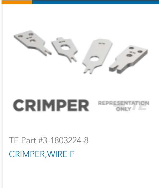
TE Part #3-1803224-8 CRIMPER, WIRE F