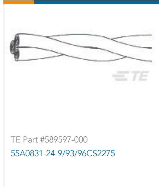
TE Part #589597-000 55A0831-24-9/93/96CS2275