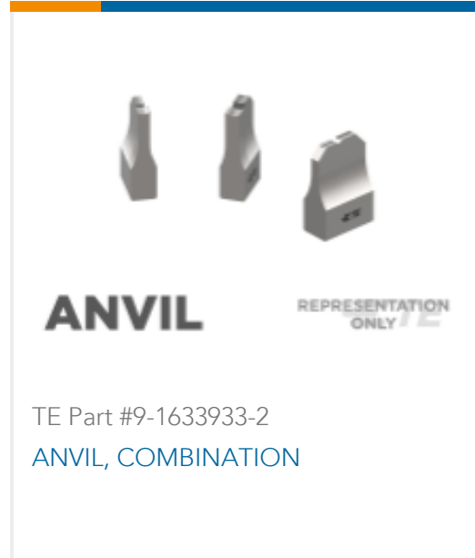
TE Part #9-1633933-2 ANVIL, COMBINATION