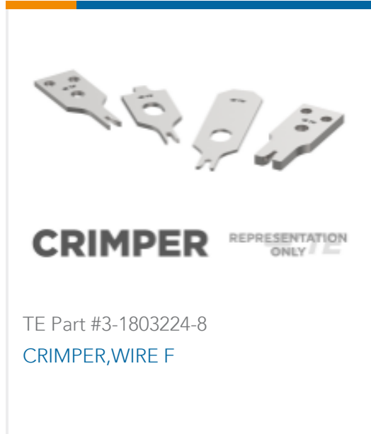
TE Part #3-1803224-8 CRIMPER, WIRE F