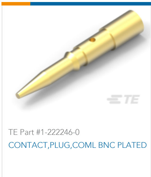
TE Part #1-222246-0 CONTACT, PLUG, COML BNC PLATED