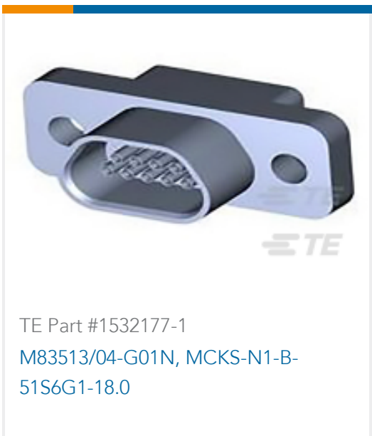
TE Part #1532177-1 M83513/04-G01N, MCKS-N1-B- 51S6G1-18.0