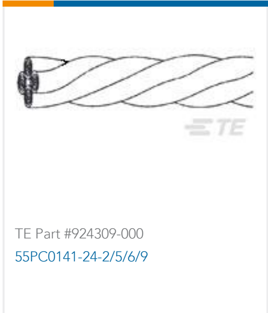
TE Part #924309-000 55PC0141-24-2/5/6/9