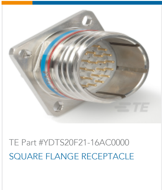
TE Part #YDTS20F21-16AC0000 SQUARE FLANGE RECEPTACLE