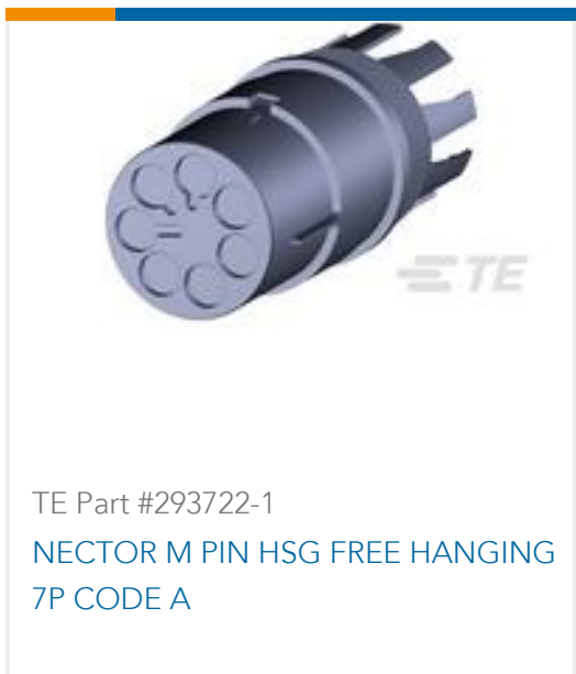
TE Part #293722-1 NECTOR M PIN HSG FREE HANGING 7P CODE A