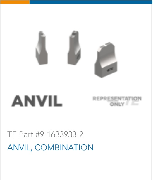
TE Part #9-1633933-2 ANVIL, COMBINATION