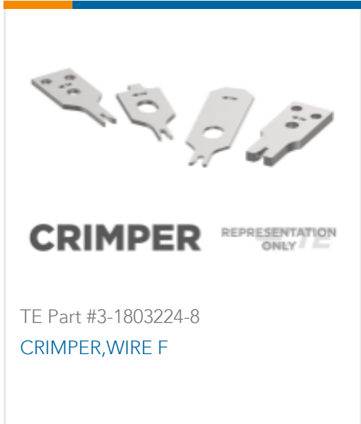
TE Part #3-1803224-8 CRIMPER, WIRE F