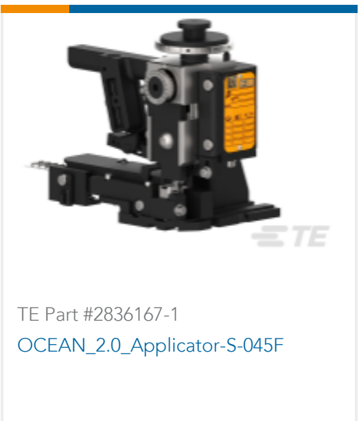
TE Part #2836167-1 OCEAN_2.0_Applicator-S-045F