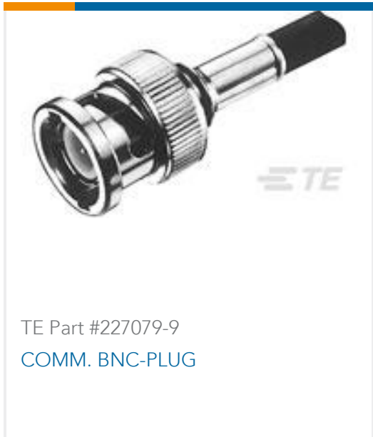
TE Part #227079-9 COMM. BNC-PLUG