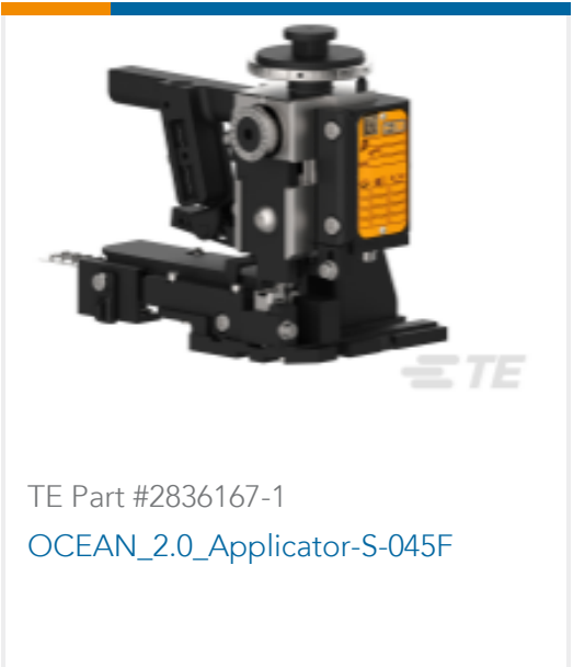
TE Part #2836167-1 OCEAN_2.0_Applicator-S-045F