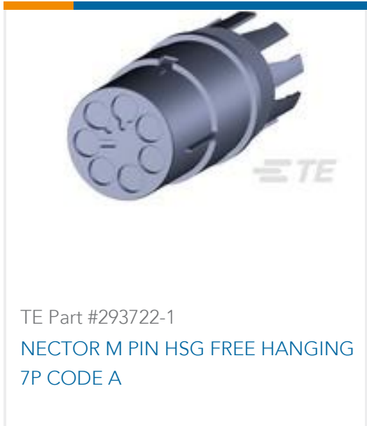
TE Part #293722-1 NECTOR M PIN HSG FREE HANGING 7P CODE A