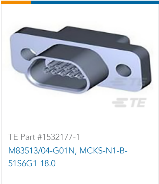
TE Part #1532177-1 M83513/04-G01N, MCKS-N1-B- 51S6G1-18.0