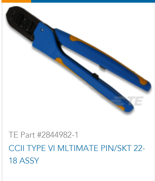
TE Part #2844982-1 CCII TYPE VI MLTIMATE PIN/SKT 22- 18 ASSY