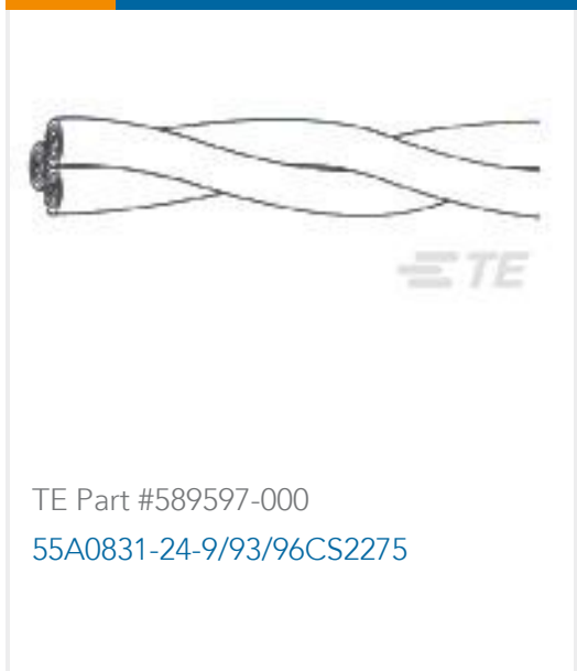
TE Part #589597-000 55A0831-24-9/93/96CS2275