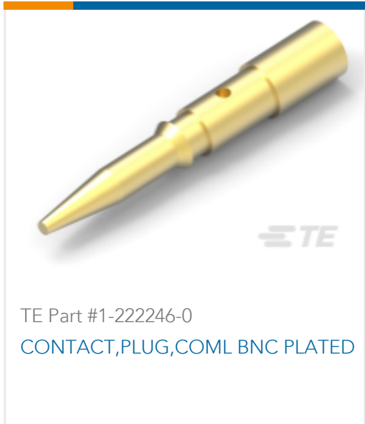
TE Part #1-222246-0 CONTACT, PLUG, COML BNC PLATED