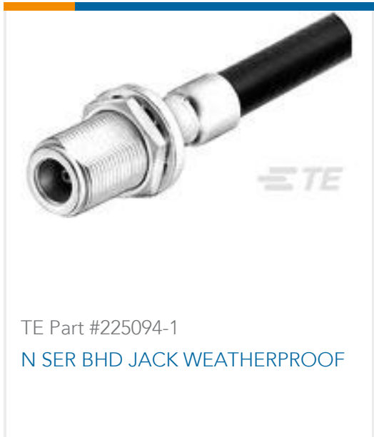
TE Part #225094-1 N SER BHD JACK WEATHERPROOF