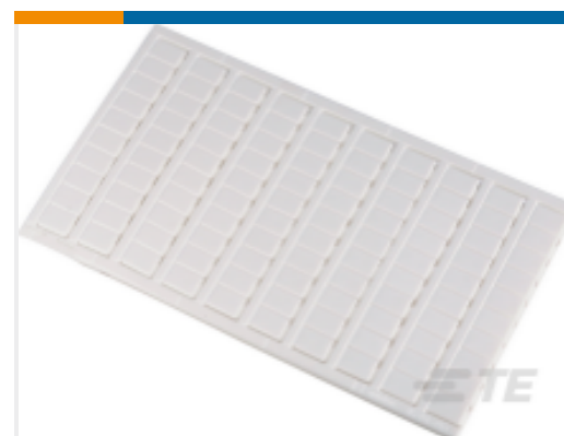
TE Part #1SNK160121R0000 MC812PA 111->120 (x10) Horizontal