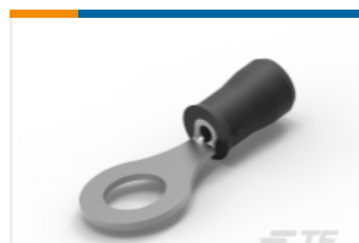
TE Part #320619 PIDG Ring Tongue Terminals