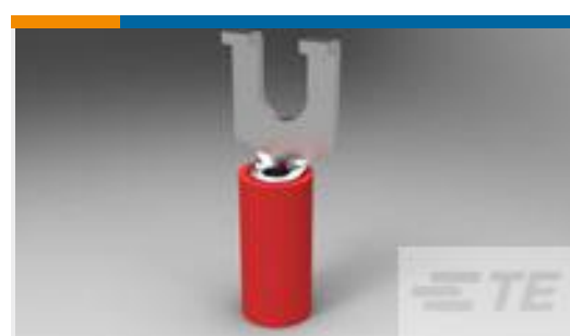
TE Part #32562 PIDG SPDFLG 22-16COMM22-18MIL6