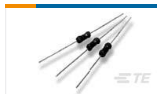
TE Part #2-1879351-7 RR01 5% 36K AMMO