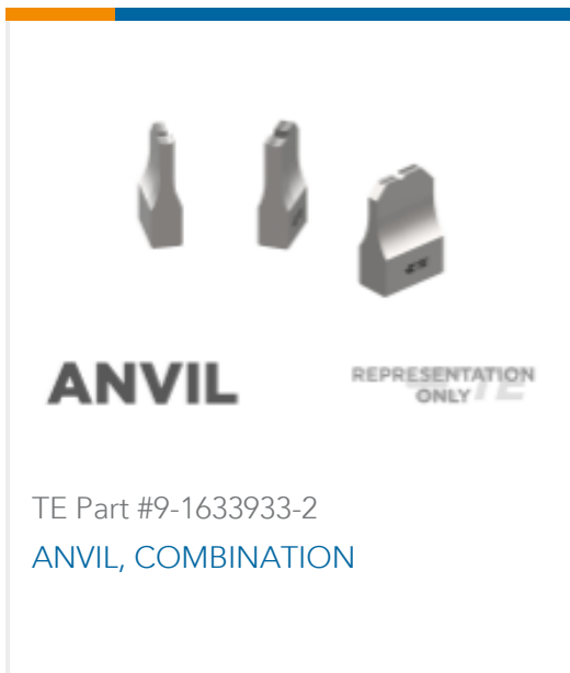
TE Part #9-1633933-2 ANVIL, COMBINATION