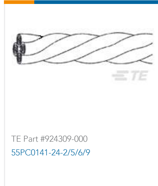
TE Part #924309-000 55PC0141-24-2/5/6/9