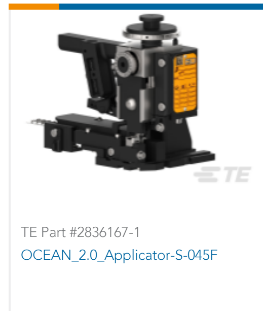
TE Part #2836167-1 OCEAN_2.0_Applicator-S-045F