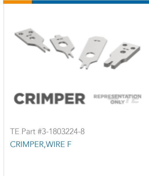
TE Part #3-1803224-8 CRIMPER, WIRE F