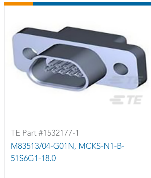
TE Part #1532177-1 M83513/04-G01N, MCKS-N1-B-51S6G1-18.0