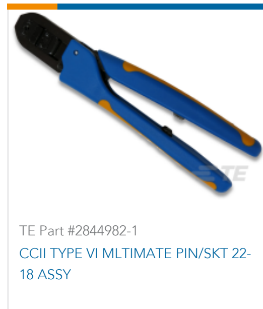
TE Part #2844982-1 CCII TYPE VI MLTIMATE PIN/SKT 22- 18 ASSY