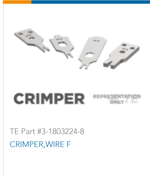
TE Part #3-1803224-8 CRIMPER, WIRE F