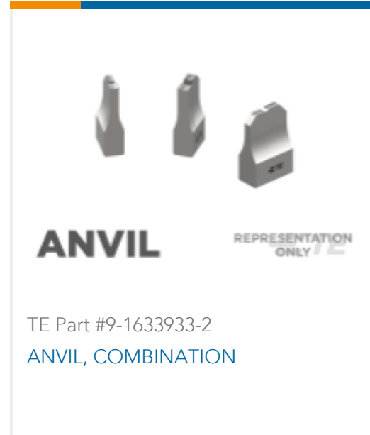
TE Part #9-1633933-2 ANVIL, COMBINATION