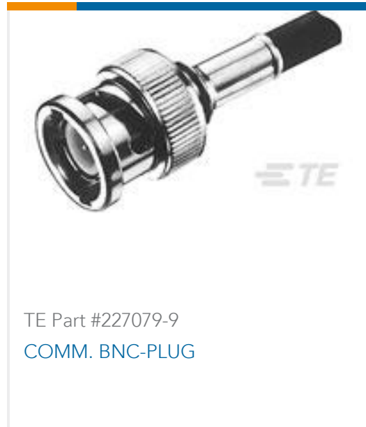
TE Part #227079-9 COMM. BNC-PLUG