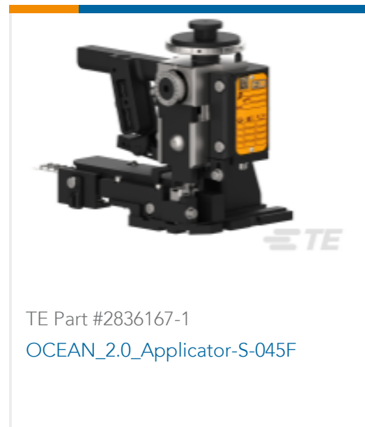
TE Part #2836167-1 OCEAN_2_0_Applicator-S-045F