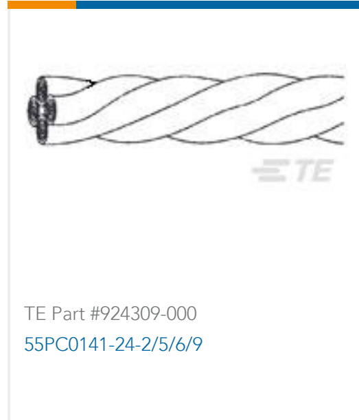
TE Part #924309-000 55PC0141-24-2/5/6/9