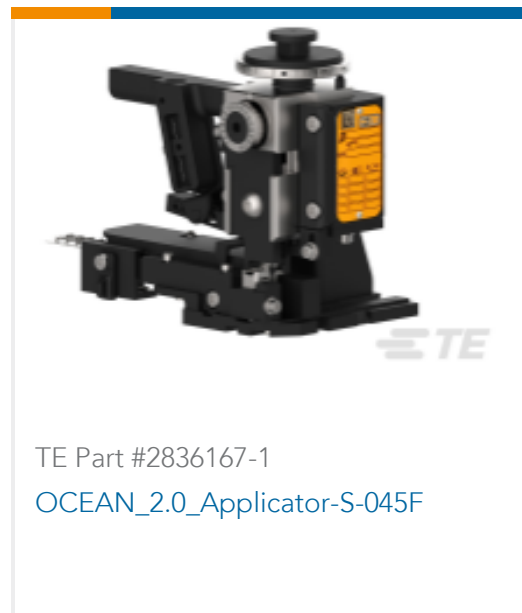
TE Part #2836167-1 OCEAN_2.0_Applicator-S-045F