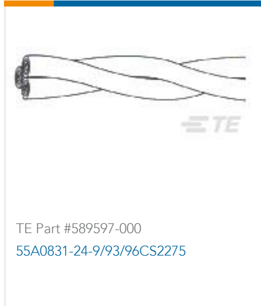
TE Part #589597-000 55A0831-24-9/93/96CS2275