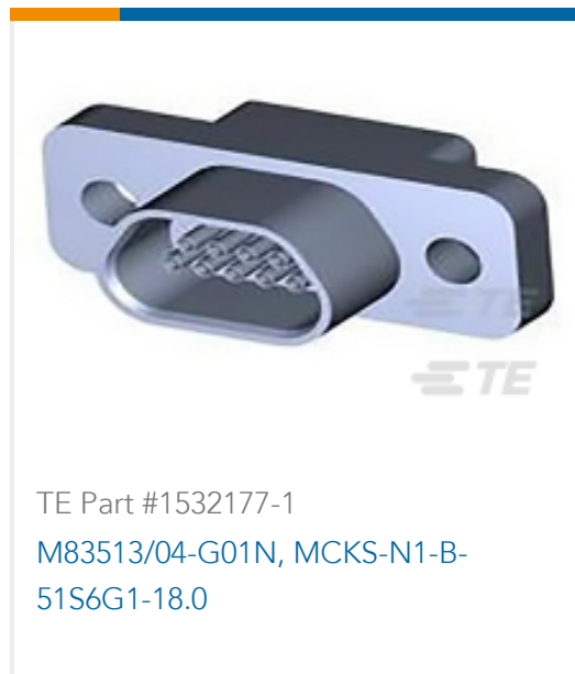
TE Part #1532177-1 M83513/04-G01N, MCKS-N1-B- 51S6G1-18.0