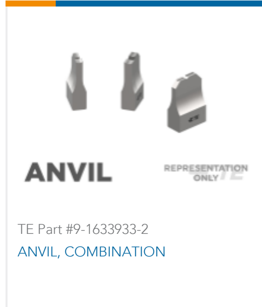
ANVIL REPRESENTATION ONLY TE Part #9-1633933-2 ANVIL, COMBINATION