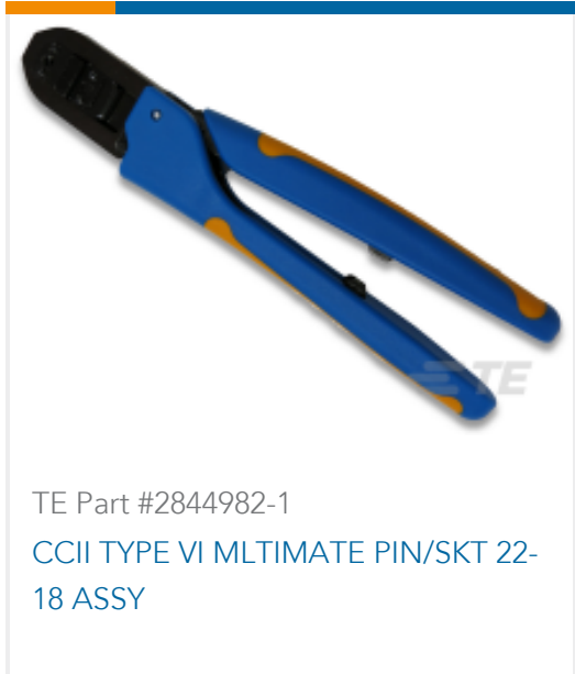
TE Part #2844982-1 CCII TYPE VI MLTIMATE PIN/SKT 22- 18 ASSY