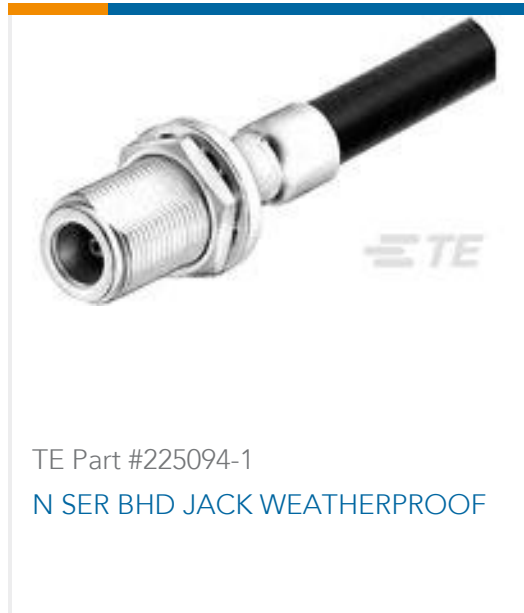
TE Part #225094-1 N SER BHD JACK WEATHERPROOF