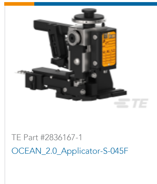
TE Part #2836167-1 OCEAN_2.0_Applicator-S-045F