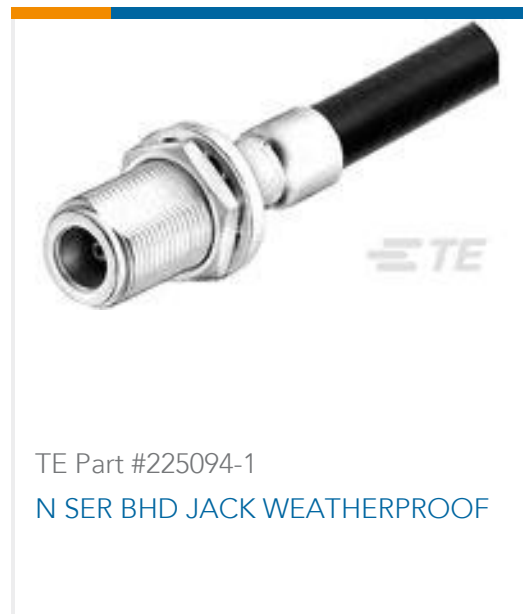
TE Part #225094-1 N SER BHD JACK WEATHERPROOF