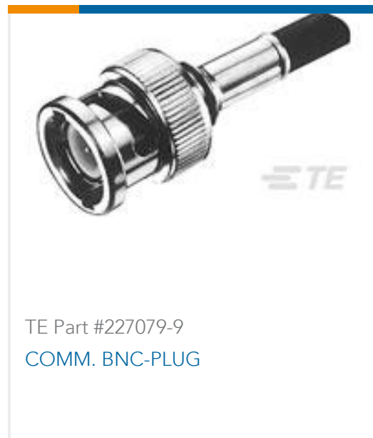
TE Part #227079-9 COMM. BNC-PLUG