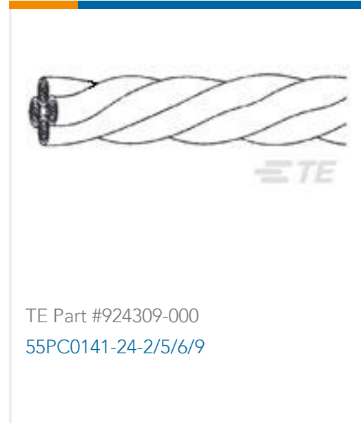
TE Part #924309-000 55PC0141-24-2/5/6/9