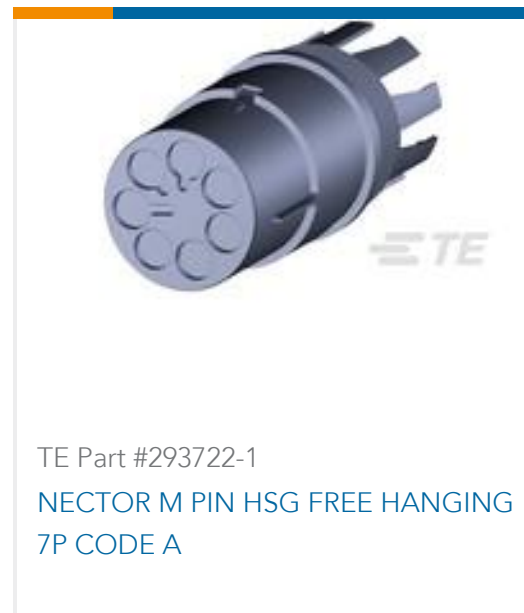
TE Part #293722-1 NECTOR M PIN HSG FREE HANGING 7P CODE A