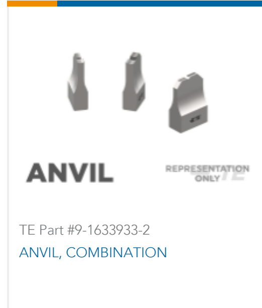
ANVIL REPRESENTATION ONLY TE Part #9-1633933-2 ANVIL, COMBINATION