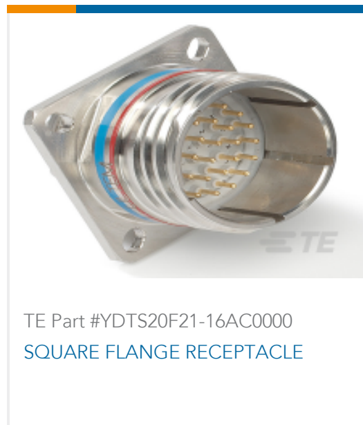
TE Part #YDTS20F21-16AC0000 SQUARE FLANGE RECEPTACLE