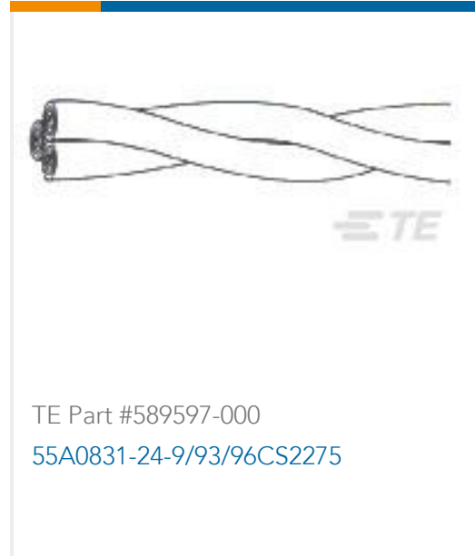
TE Part #589597-000 55A0831-24-9/93/96CS2275