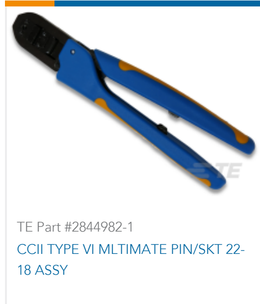
TE Part #2844982-1 CCII TYPE VI MLTIMATE PIN/SKT 22- 18 ASSY