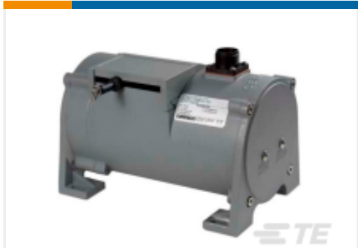
TE Part #04-0979-0739 PT9420-0500-324-1520