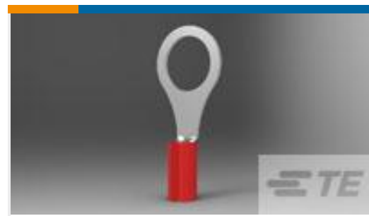
TE Part #2-320573-2 TERMINAL,PIDG R IR 20 3/8