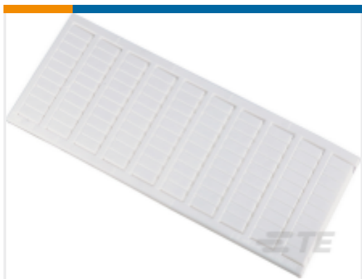
TE Part #1SNK145022R0000 MC512PA 101->200 Vertical