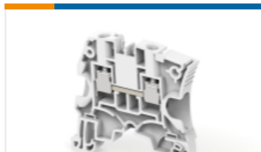
TE Part #1SNK506010R0000 ZS6