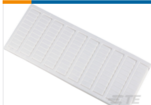
TE Part #1SNK140022R0000 MC512PA 11->20 (x10) Vertical