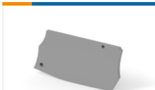
TE Part #1SNK505910R0000 ES4