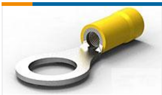
TE Part #34173 TERMINAL,PG R 12-10 3/8