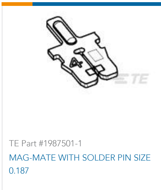
TE Part #1987501-1 MAG-MATE WITH SOLDER PIN SIZE 0.187