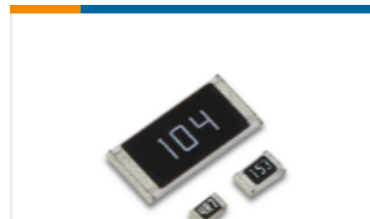
TE Part #5-2176347-9 CRGCQ 2010 680K 1%