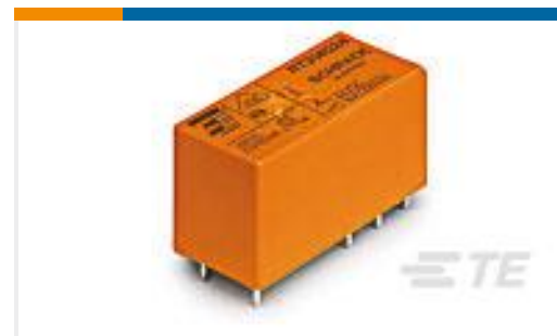
TE Part #1-1415538-1 RTH14012WG