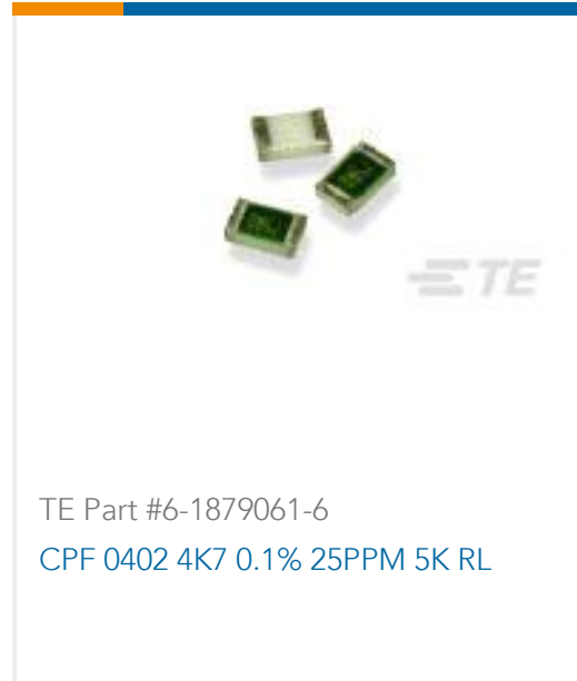
TE Part #6-1879061-6 CPF 0402 4K7 0.1% 25PPM 5K RL