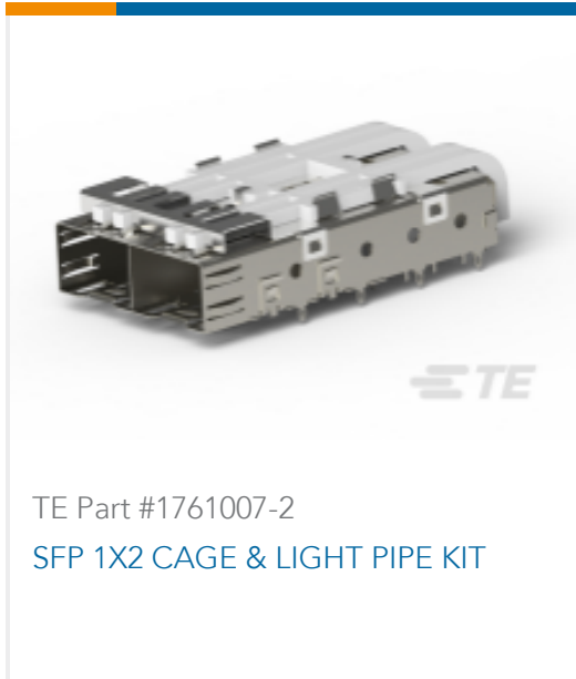
TE Part #1761007-2 SFP 1X2 CAGE & LIGHT PIPE KIT