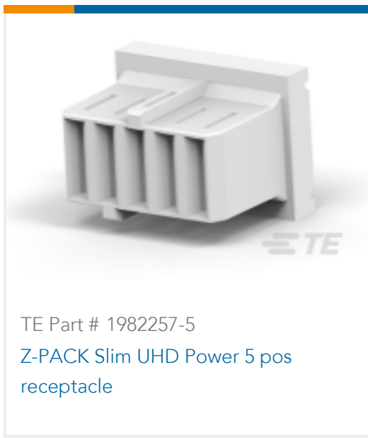
TE Part # 1982257-5 Z-PACK Slim UHD Power 5 pos receptacle