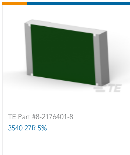
TE Part #8-2176401-8 3540 27R 5%