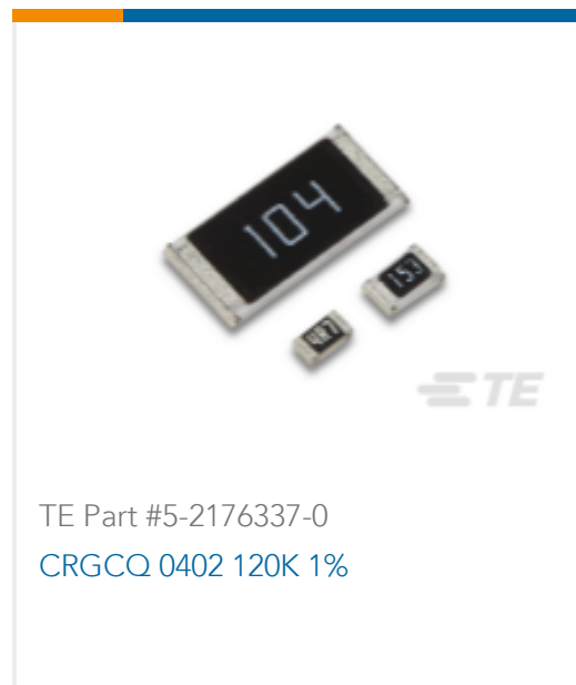
TE Part #5-2176337-0 CRGCQ 0402 120K 1%