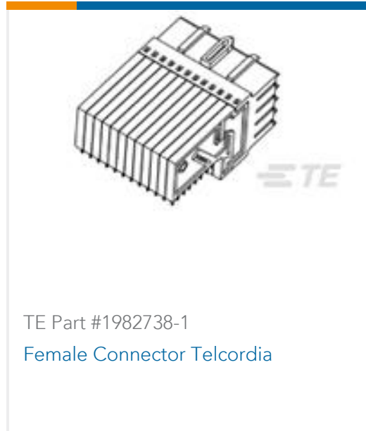
TE Part #1982738-1 Female Connector Telcordia