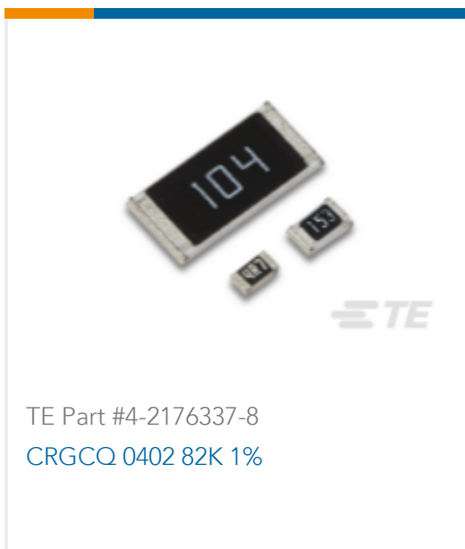
TE Part #4-2176337-8 CRGCQ 0402 82K 1%