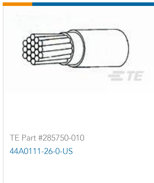
TE Part #285750-010 44A0111-26-0-US