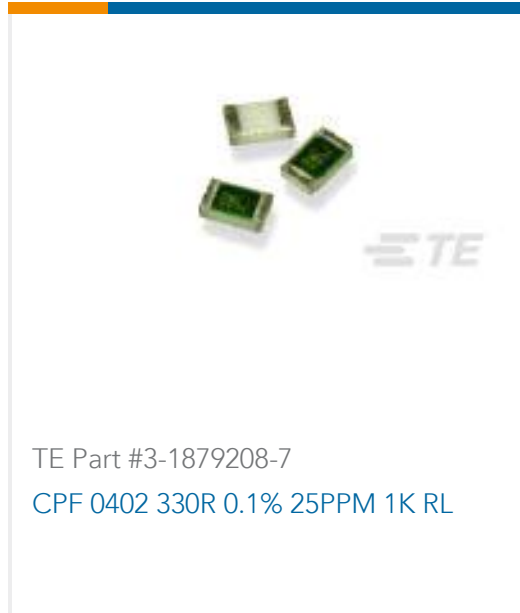
TE Part #3-1879208-7 CPF 0402 330R 0.1% 25PPM 1K RL