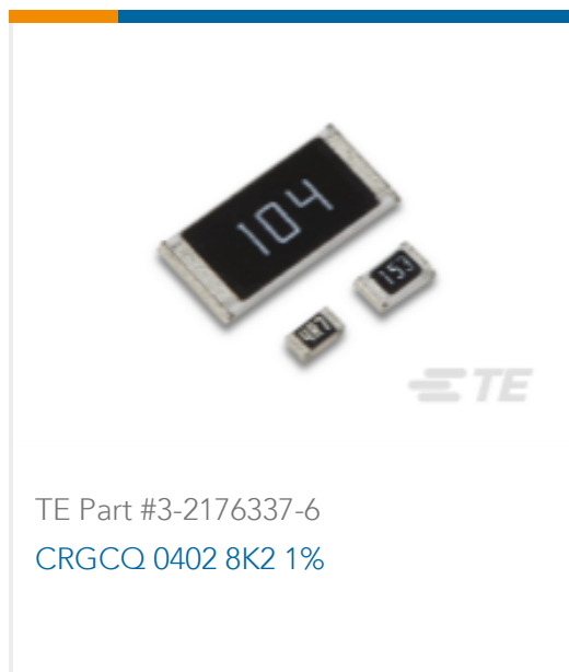
TE Part #3-2176337-6 CRGCQ 0402 8K2 1%