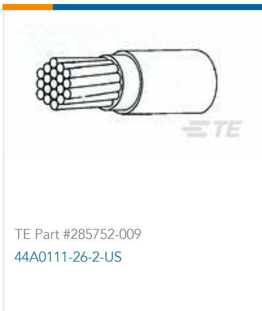
TE Part #285752-009 44A0111-26-2-US