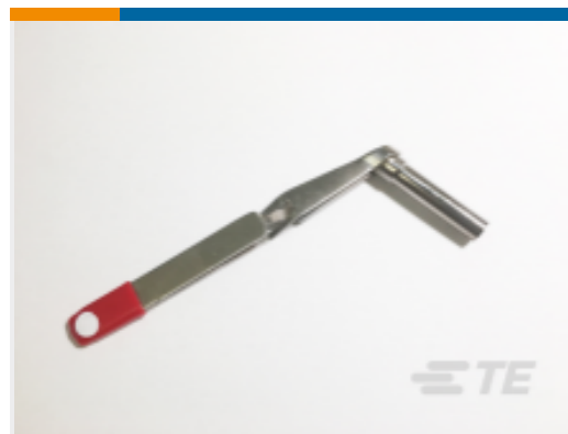
TE Part #1738894-1 TWEEZER REMOVAL TOOL,QUADRAX