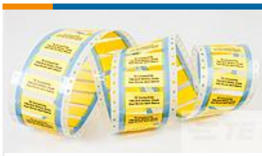
TE Part #6641710001 TMS-SCE-1/4-2.0-9