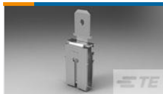
TE Part #63667-1 MAG-MATE 187 FAST TAB 020TPBR