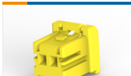
TE Part #4-1971793-3 STD Temp Sig GRACE INERTIA Plug