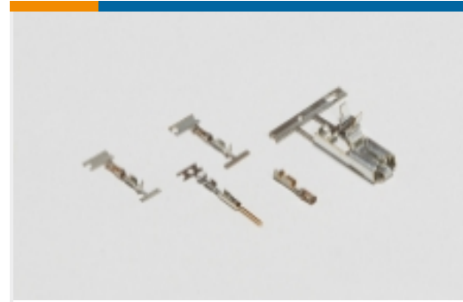
Wire-to-Board Connector Contacts(4)