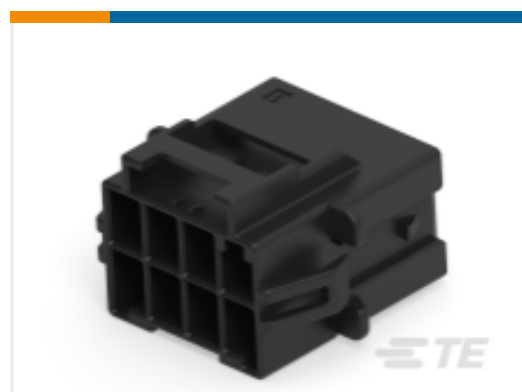
TE Part # 1-2232264-4 PTL 2X4 CAP PANEL MT HOT WIRE KEY A BLK