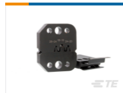
TE Part # 2217267-2 SDE COMMERCIAL TOOL/DIE