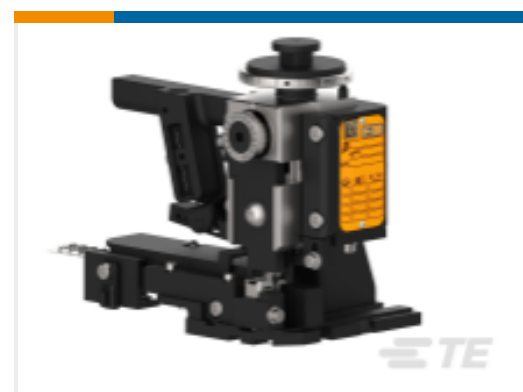
TE Part # 2151746-1 OCEAN_2.0_Applicator-S-080F120F