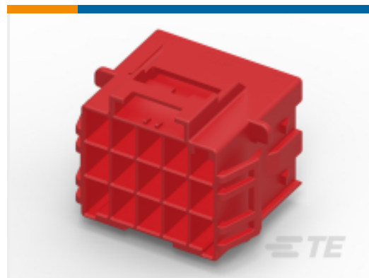
TE Part # CAT-P87074-C1701A POWER TRIPLE LOCK High Temperature Caps