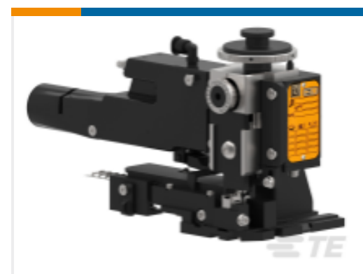
TE Part # 2151746-2 OCEAN_2.0_Applicator-S-080F120F