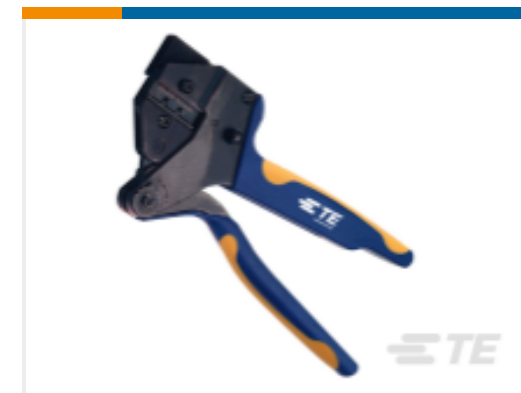
TE Part # 2217267-1 SDE COMMERCIAL TOOL/DIE