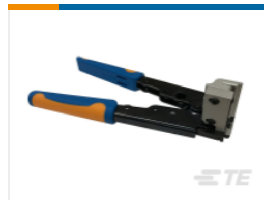
TE Part # 2305570-1 Strip Terminal Cutter-Side Feed-No Crimp