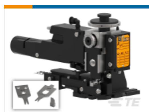
TE Part # 7-2151746-2 OCEAN_2.0_Applicator-S-080F120F