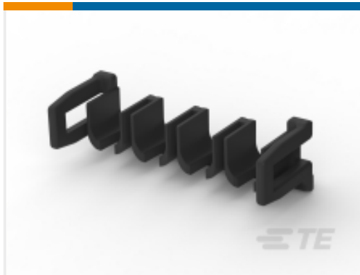
TE Part #1971777-3 Locking Plate, POWER TRIPLE LOCK, TPA