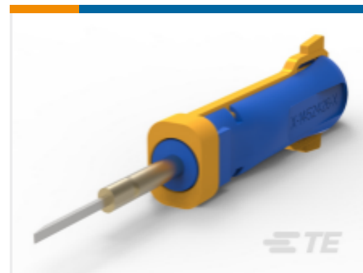
TE Part # 1452426-1 EXTRACTION TOOL