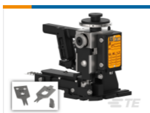
TE Part # 7-2151746-1 OCEAN_2.0_Applicator-S-080F120F