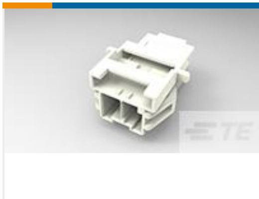
TE Part #1-1971772-2 PTL 1X2 CAP PANEL MT STD TEMP KEY A NAT