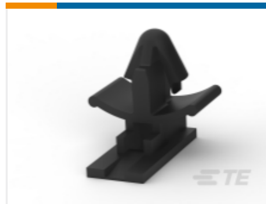
TE Part #936552-2 CLIP HSG FOR 187 CONN BLACK