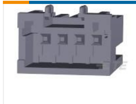
TE Part #316088-1 2.5 SIGNAL D/LOCK CAP HSG 4P