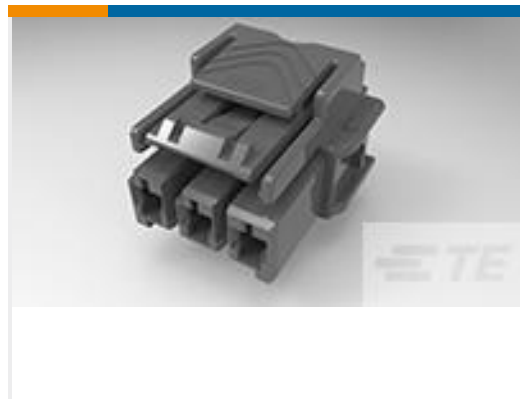
TE Part #5-2232265-3 PTL 1X3 PLUG HSG GLW WIRE KEY A DGR