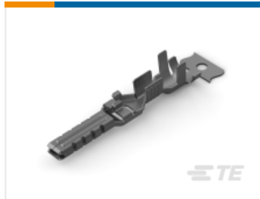
TE Part #1971786-2 Tab Contact — POWER TRIPLE LOCK