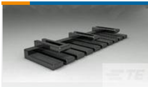
TE Part #1-1969443-0 EP 2.5 TPA Retainer, 10 Pos