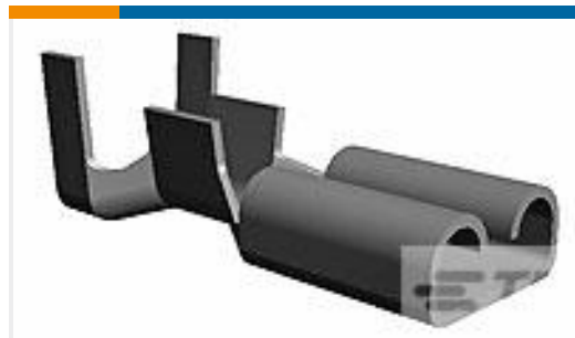
TE Part #60487-1 187 FASTON REC 18-16 AWG BR