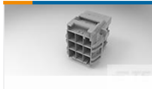
TE Part #5-1971875-3 PTL 3X3 CAP PANEL MT HITEMP KEY A LGR