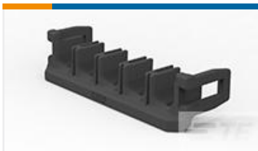
TE Part #1971777-5 PTL TPA HIGH TEMP 1 x 5 BLACK