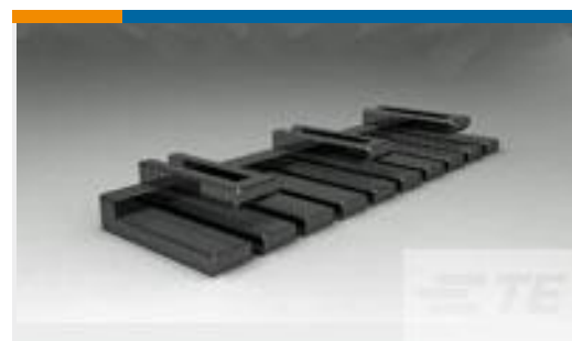
TE Part #1-1969443-0 EP 2.5 TPA Retainer, 10 Pos