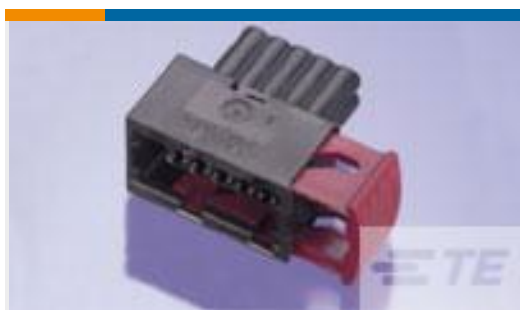
TE Part #3-963217-1 16 J-P-T GEH KOMPL