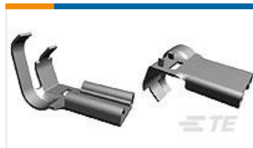
TE Part #1742543-1 250 FASTON,FLAG,REC.,18-12 AWG, NPST