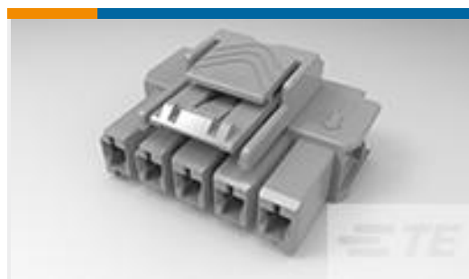
TE Part #5-1971773-7 PTL 1X5 PLUG HSG HIGH TEMP KEY A LGR