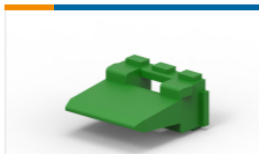
TE Part #W6P-P004 WEDGE LOCK