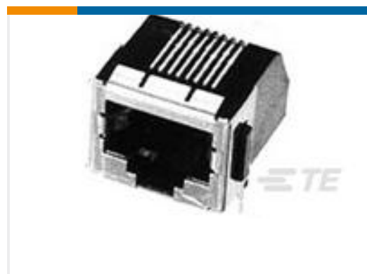
TE Part #5555153-1 MJ,LPF,R/A,8P,PCBG,PSTP.15TTR