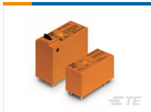
TE Part #1415898-4 PCB Power Relay: 16 Amp, Inrush