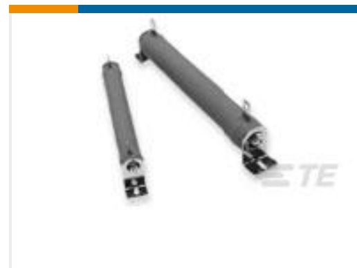
TE Part #2-1879453-1 TE 1000W 47R 5% Bracket