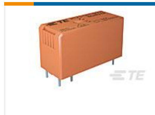
TE Part #1937650-5 RTX3-1AT-B012