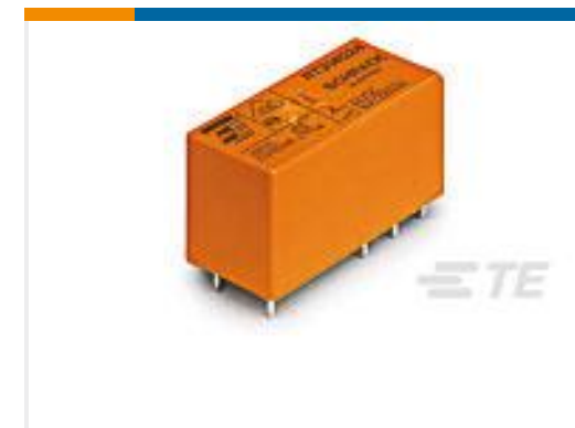
TE Part #7-1393239-5 RT31L024