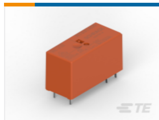
TE Part #1-1415898-5 RTS3TA05