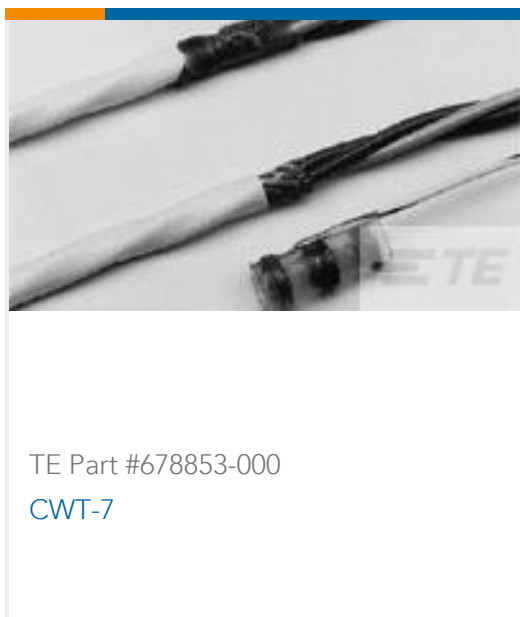
TE Part #678853-000 CWT-7