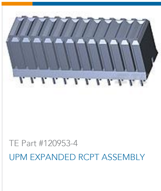
TE Part #120953-4 UPM EXPANDED RCPT ASSEMBLY