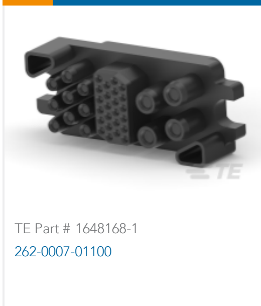
TE Part # 1648168-1 262-0007-01100