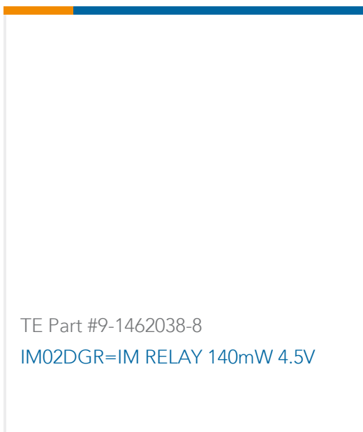
TE Part #9-1462038-8 IM02DGR=IM RELAY 140mW 4.5V