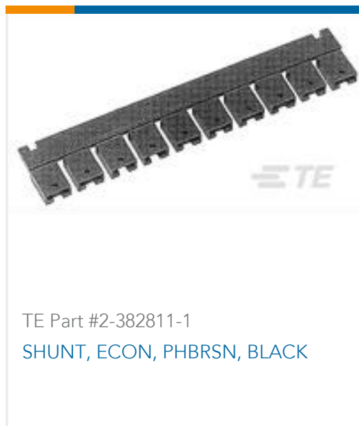
TE Part #2-382811-1 SHUNT, ECON, PHBR SN, BLACK