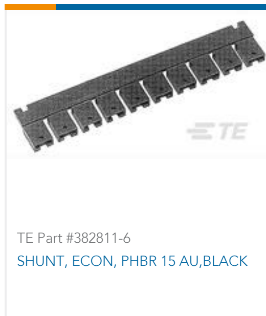
TE Part #382811-6 SHUNT, ECON, PHBR 15 AU,BLACK