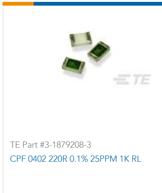
TE Part #3-1879208-3 CPF 0402 220R 0.1% 25PPM 1K RL