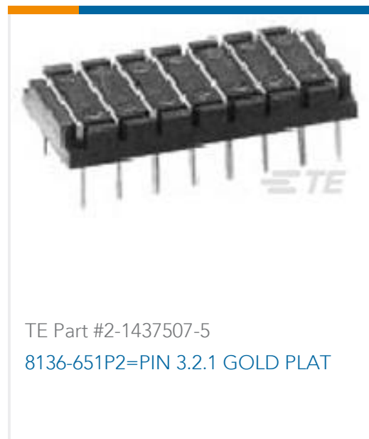
TE Part #2-1437507-5 8136-651P2=PIN 3.2.1 GOLD PLAT