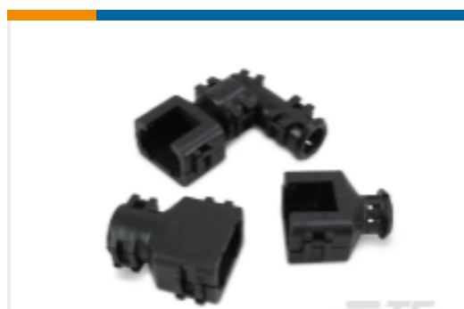
TE Part #2035366-2 AMPSEAL 16 Connectors Backshell