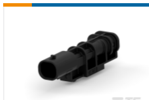
TE Part #2292937-1 2POS, 1.2X0.6, TAB HSG ASSY, SLD, COD A