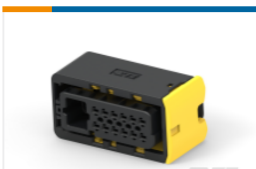
TE Part #9-2348795-1 HD MATEnet 1+12 REC HSG ASSY, GRP E