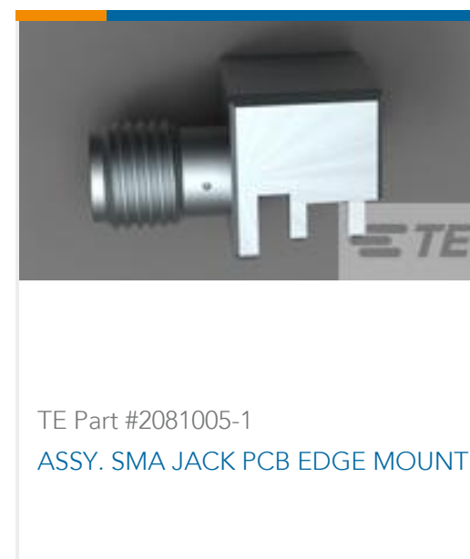
TE Part #2081005-1 ASSY. SMA JACK PCB EDGE MOUNT