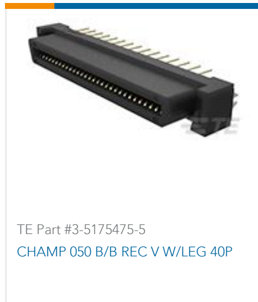
TE Part #3-5175475-5 CHAMP 050 B/B REC V W/LEG 40P