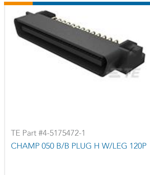
TE Part #4-5175472-1 CHAMP 050 B/B PLUG H W/LEG 120P