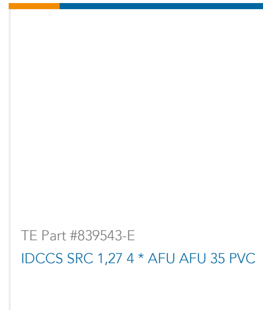
TE Part #839543-E IDCCS SRC 1,27 4 * AFU AFU 35 PVC