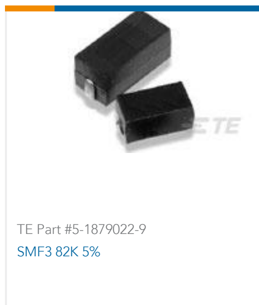
TE Part #5-1879022-9 SMF3 82K 5%