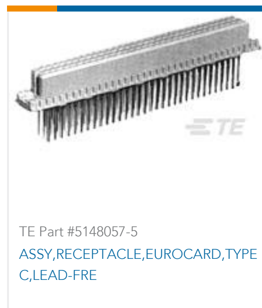
TE Part #5148057-5 ASSY, RECEPTACLE, EUROCARD, TYPE C, LEAD-FRE