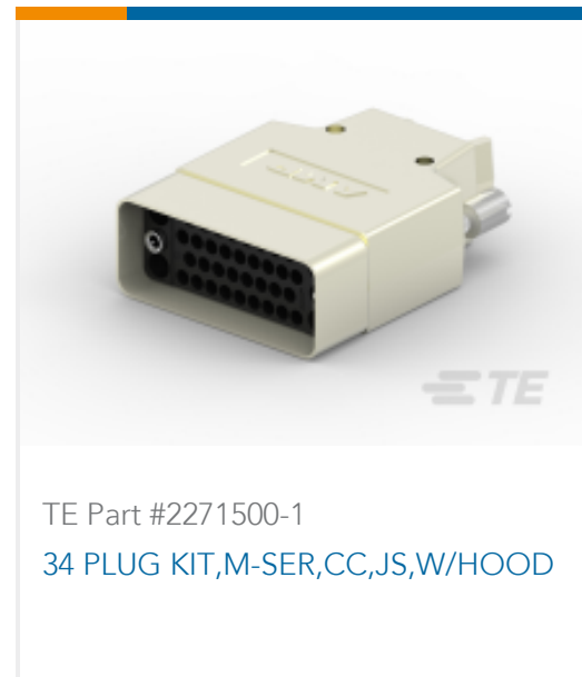
TE Part #2271500-1 34 PLUG KIT,M-SER,CC,JS,W/HOOD