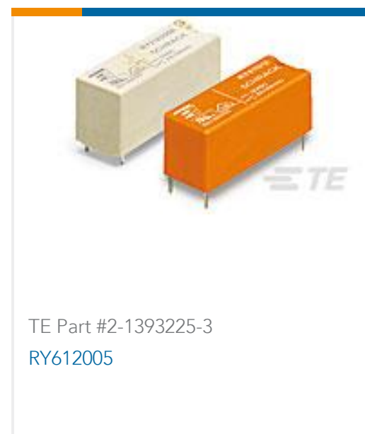
TE Part #2-1393225-3 RY612005