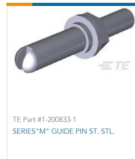
TE Part #1-200833-1 SERIES "M" GUIDE PIN ST. STL.