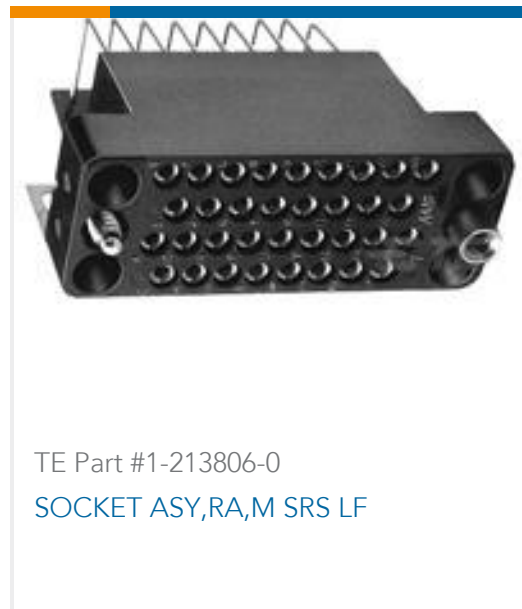
TE Part #1-213806-0 SOCKET ASY,RA,M SRS LF