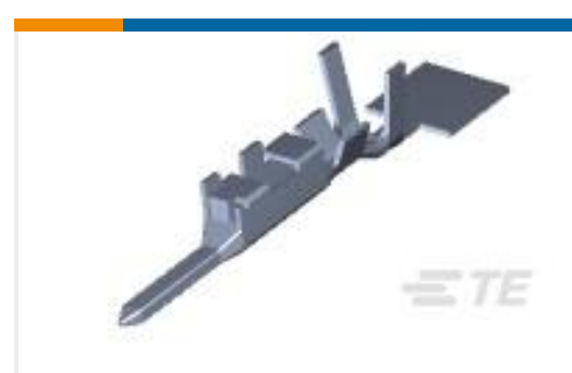
TE Part #1903117-2 DYNAMIC D1000 TAB CONT AU 0.38 um L L/P