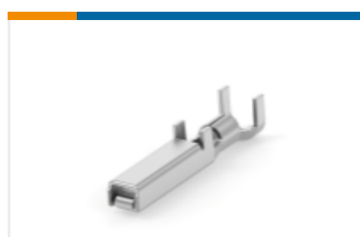
TE Part #175287-2 Contact: Component To Wire; 15A, 28- 14 wire size