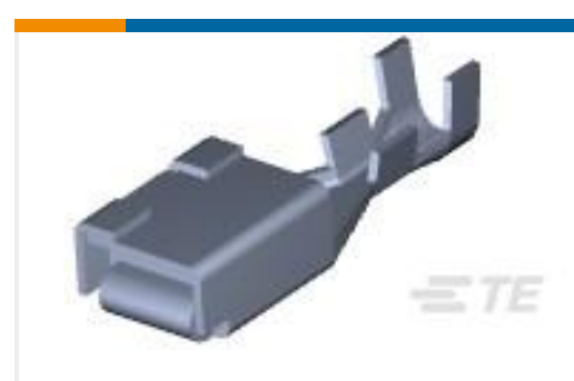
TE Part #1318986-2 DYNAMIC D-5 REC CONT SS L/P AU