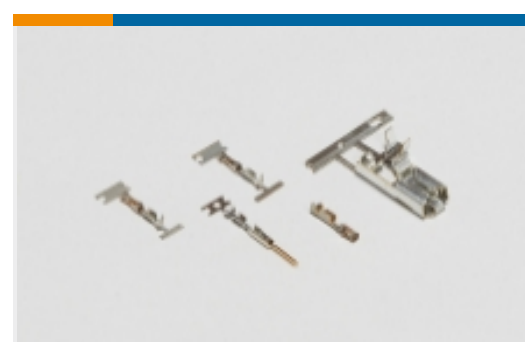
Wire-to-Board Connector Contacts(39)