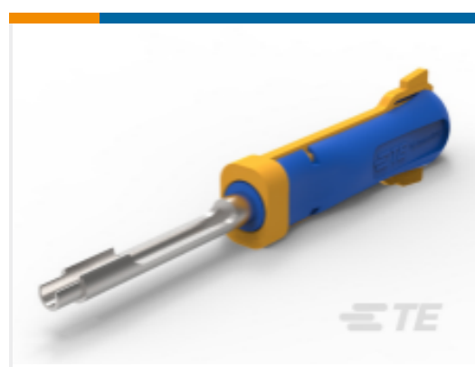
TE Part #217369-2 EXTRACTION TOOL