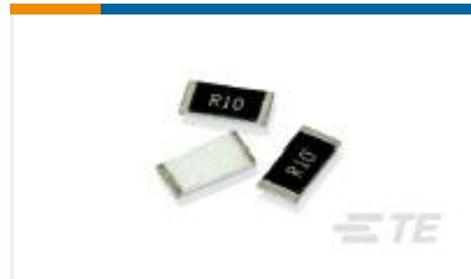
TE Part #2-2176053-4 RLP73N 2A R47 1% 1K RL