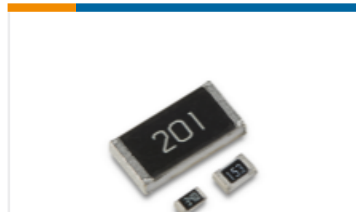
TE Part #3-2176326-1 CRGP 0603 3K3 1%