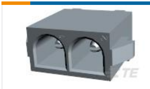
TE Part #350787-1 02P UMNL PIN HDR ASSY 94VO