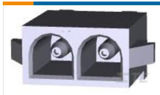
TE Part #1586953-1 02P UMNL PIN HDR ASSY NATL, GW