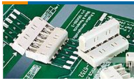
TE Part #1954289-2 Connector, Blade & Recept 4 Pos