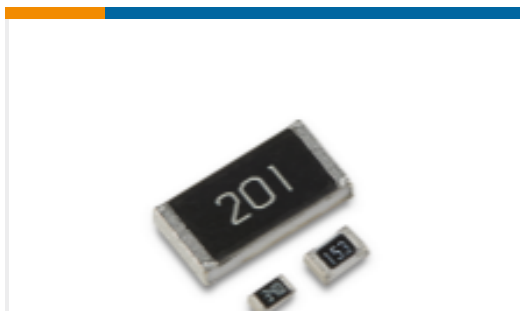
TE Part #5-2176327-3 CRGP 0805 220K 1%