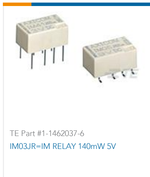
TE Part #1-1462037-6 IM03JR=IM RELAY 140mW 5V