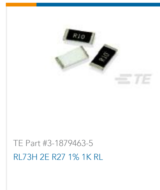
TE Part #3-1879463-5 RL73H 2E R27 1% 1K RL