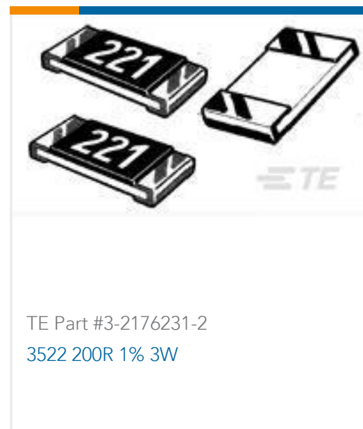
TE Part #3-2176231-2 3522 200R 1% 3W