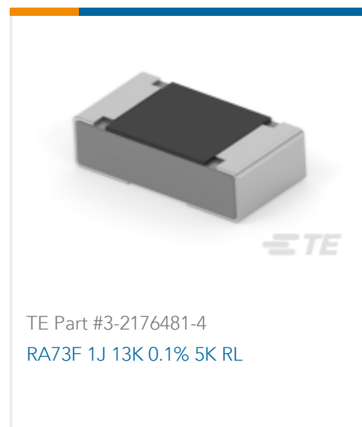
TE Part #3-2176481-4 RA73F 1J 13K 0.1% 5K RL