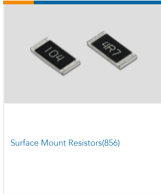
Surface Mount Resistors(856)