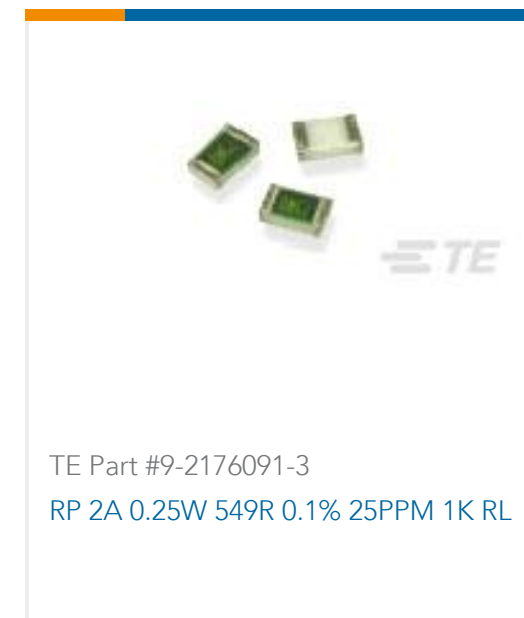
TE Part #9-2176091-3 RP 2A 0.25W 549R 0.1% 25PPM 1K RL