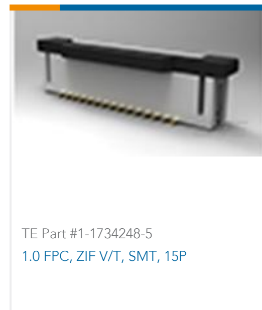
TE Part #1-1734248-5 1.0 FPC, ZIF V/T, SMT, 15P