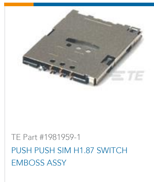
TE Part #1981959-1 PUSH PUSH SIM H1.87 SWITCH EMBOSS ASSY