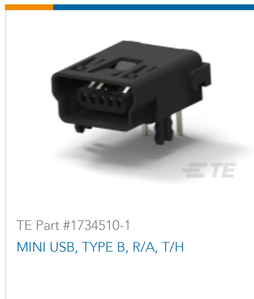
TE Part #1734510-1 MINI USB, TYPE B, R/A, T/H