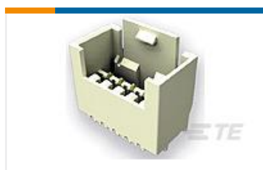
TE Part #1-1971817-7 7P,RAST 2.5 Tab Header,Ex- Locking, THV