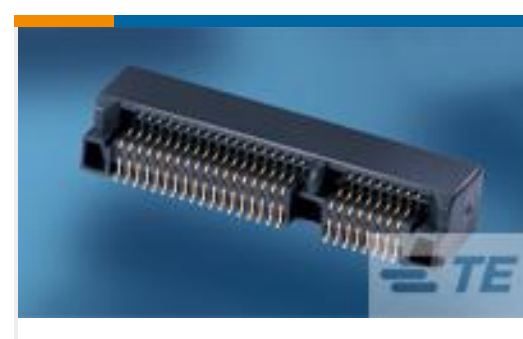
TE Part #1775838-2 mSATA/mini PCI-E 5.6H Type I G/F