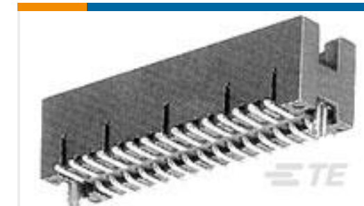
TE Part #6-104655-1 100 50/50 HDR DRST SFMNT TIN