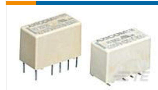
TE Part #5-1393789-1 V23079G2003B301