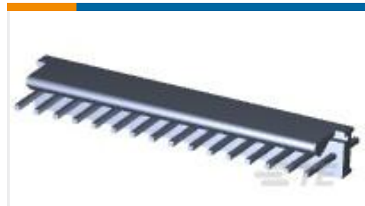
TE Part #1-640456-6 16P MTA100 HDR ASSY F/L SQ STR