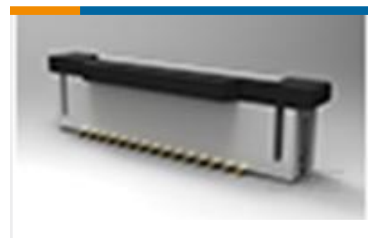
TE Part #2-1734248-4 1.0 FPC, ZIF V/T, SMT, 24P