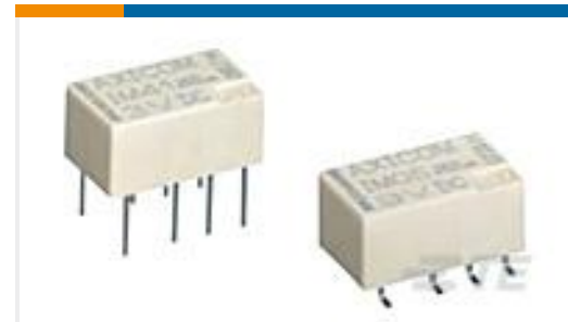
TE Part #2-1462037-3 IM06GR=IM Relay 140mW 12V