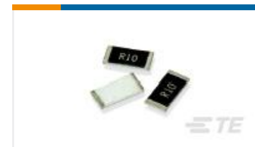
TE Part #3-1622824-0 RL73H 3A R11 1% 4K RL