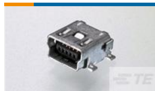
TE Part #1734327-2 MINI USB, TYPE A, R/A, SMT