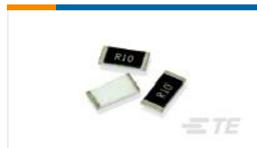
TE Part #3-2176056-6 RLP73K 2B R30 5% 5K RL