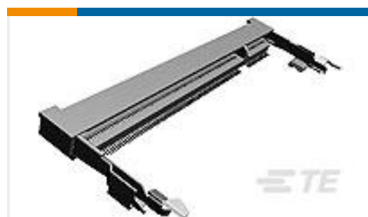
TE Part #1612507-3 HARD TRAY ASS'Y DDR SODIMM SOC