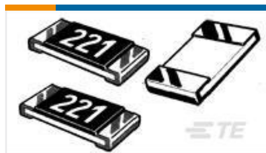
TE Part #2176231-9 3522 22R 1% 3W