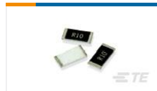
TE Part #2176057-7 RLP73V 3A R018 1% 1K RL