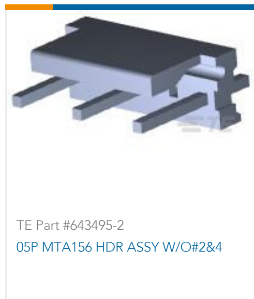
TE Part #643495-2 05P MTA156 HDR ASSY W/O#2&4