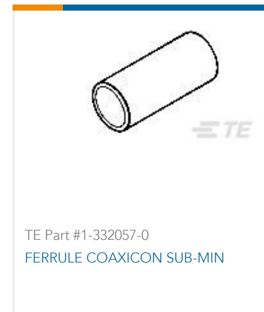
TE Part #1-332057-0 FERRULE COAXICON SUB-MIN