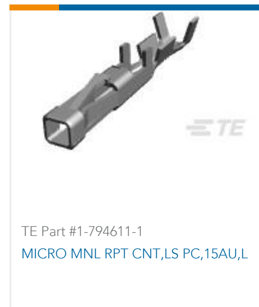
TE Part #1-794611-1 MICRO MNL RPT CNT,LS PC,15AU,L