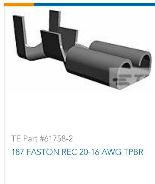
TE Part #61758-2 187 FASTON REC 20-16 AWG TPBR