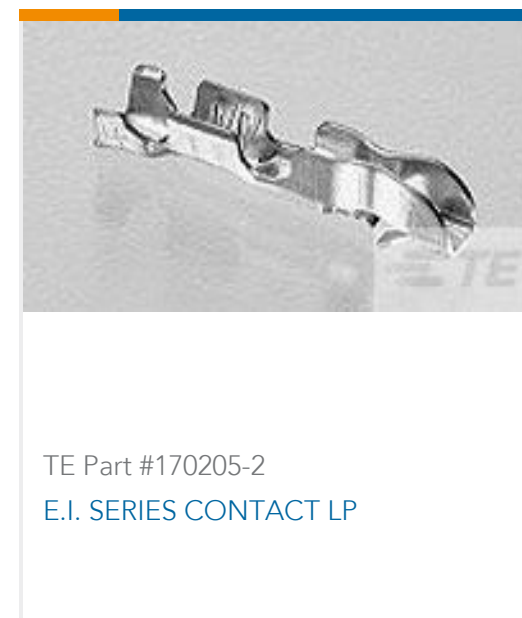
TE Part #170205-2 E.I. SERIES CONTACT LP