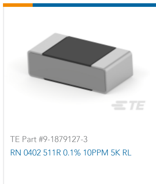
TE Part #9-1879127-3 RN 0402 511R 0.1% 10PPM 5K RL