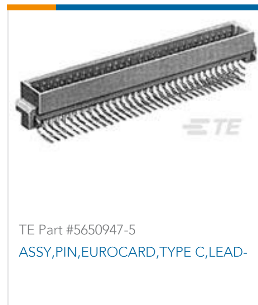
TE Part #5650947-5 ASSY,PIN,EUROCARD,TYPE C,LEAD-