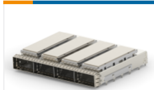
TE Part #2354935-1 CAGE ASSEMBLY, 1X4, QSFP28, TB