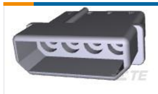
TE Part #1-480426-9 04P CMNL CAP HSG F/H BLK