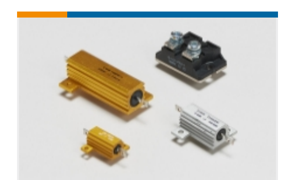
Chassis Mount Resistors(750)