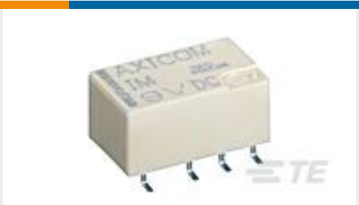
TE Part #1462041-7 IMB03CGR=IM RELAY 140mW 5V HDV