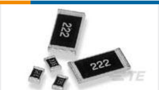
TE Part #9-1879494-7 CRGH0603 5% 10K 0.2W