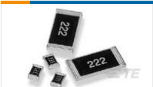
TE Part #1622877-1 CRG0603 1% 1M0