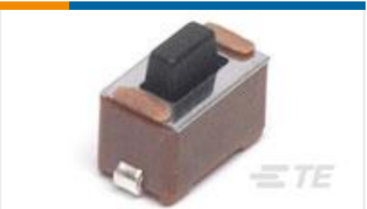
TE Part #1437566-3 FSMSM=3.5X6 SMT TACT