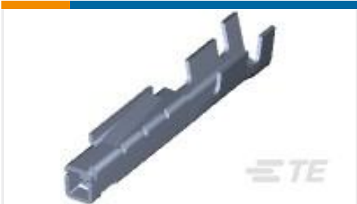
TE Part #1318107-1 DYNAMIC D-2000 REC CONT M L/P