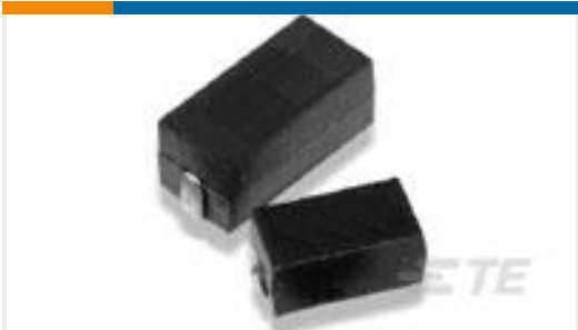
TE Part #1879233-2 SMW5 R11 5%