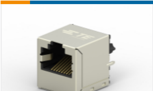
TE Part #5-2301995-1 RJ45 JACK INT.MAG. 1GB 1X1 VERT.