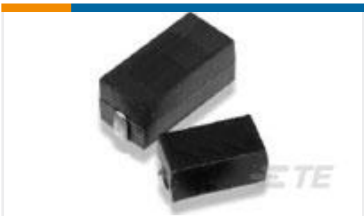
TE Part #1879233-4 SMW5 R13 5%