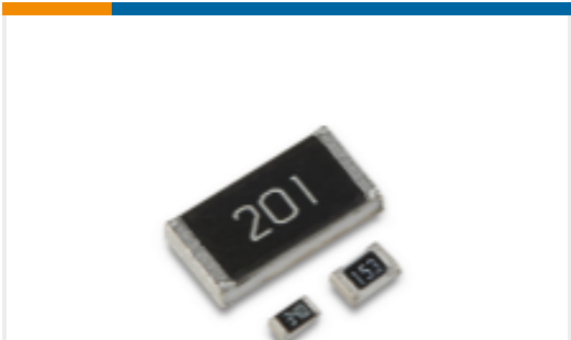
TE Part #2176329-1 CRGP 1210 10R 1%