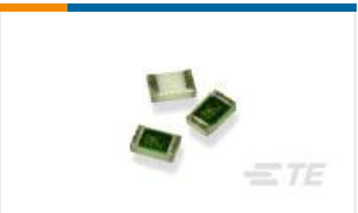
TE Part #1-1676481-9 CPF 0603 30R 0.1% 25PPM 1K RL