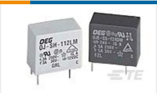
TE Part #1721870-5 OJE-SH-112LMHF,000