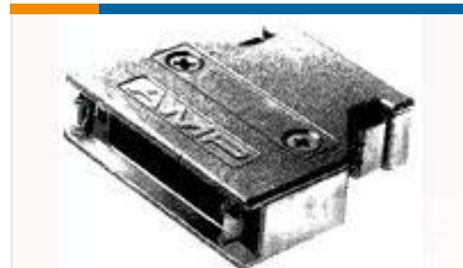
TE Part #749608-2 26 50SR KIT, ST, UK