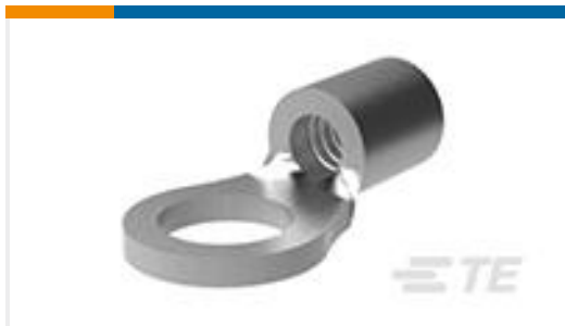
TE Part #32859 TERMINAL,BUDG R 26-22 8