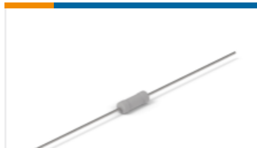
TE Part #1-1676123-9 1/2W SM M/OX 5% 4R7