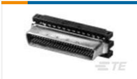
TE Part #5749621-2 26 50S CABLE PLUG CONN/COV KIT