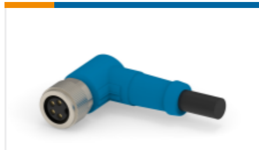
TE Part #T4061410004-002 M8 CABLE RA FEMALE 1.0M 4POS PVC CABLE