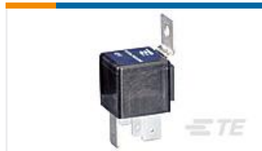
TE Part #3-1415001-2 V23134J0052X511-EV-CBOX