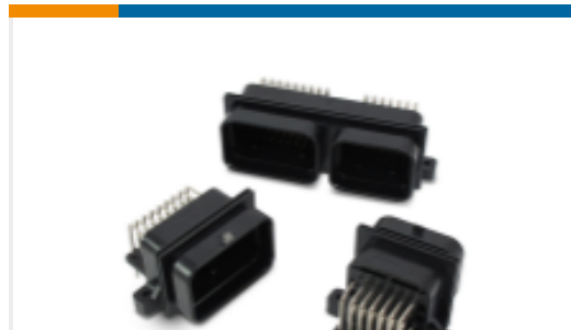
TE Part #6437288-2 SUPERSEAL Connector Headers: 1.0 mm