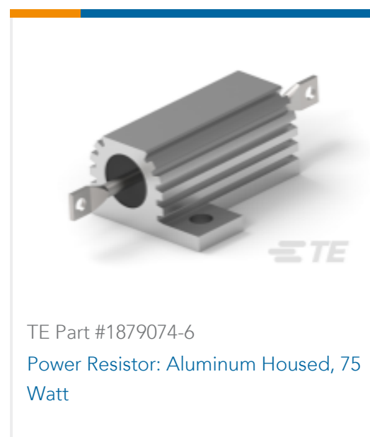
TE Part #1879074-6 Power Resistor: Aluminum Housed, 75 Watt