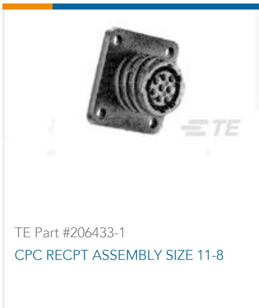
TE Part #206433-1 CPC RECPT ASSEMBLY SIZE 11-8