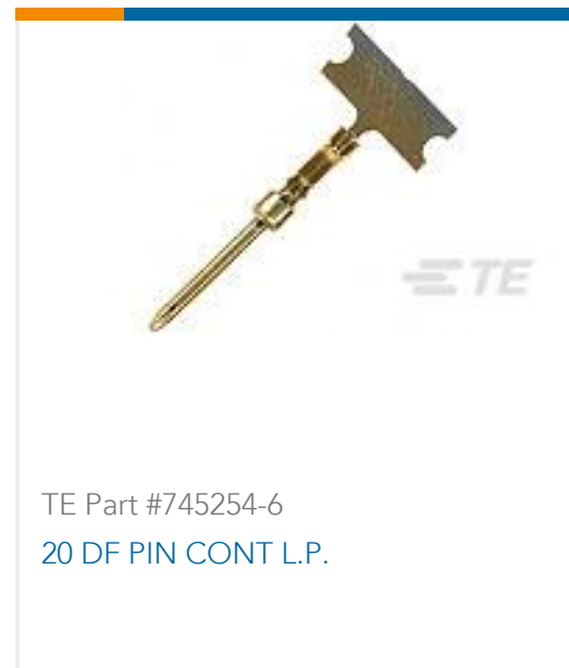
TE Part #745254-6 20 DF PIN CONT L.P.