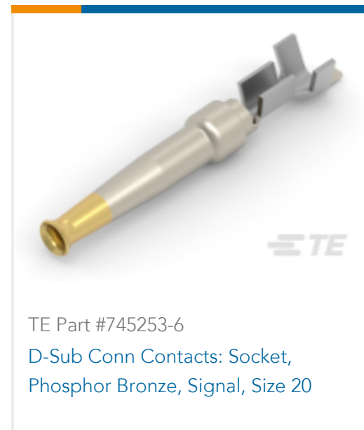
TE Part #745253-6 D-Sub Conn Contacts: Socket, Phosphor Bronze, Signal, Size 20