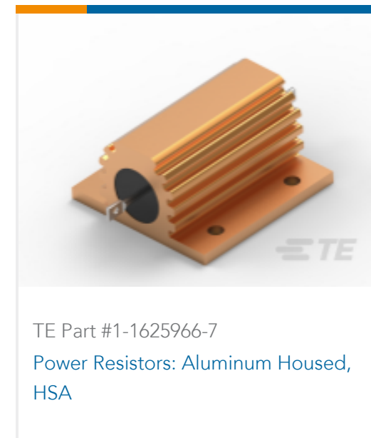
TE Part #1-1625966-7 Power Resistors: Aluminum Housed, HSA