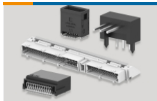
PCB Headers & Receptacles(173)