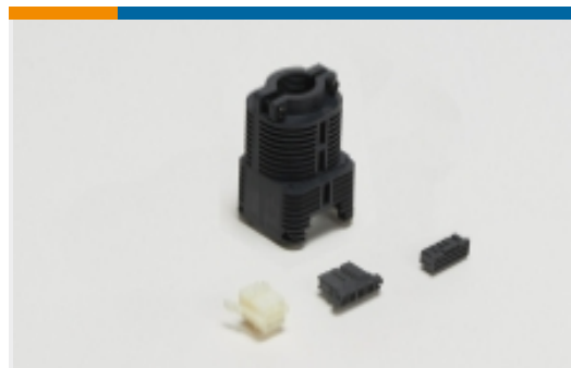
Rectangular Connector Housings(2)