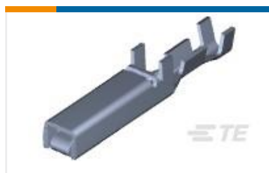
TE Part #1-175216-2 DYNAMIC D-3 REC CONT. S AU 0.38 L /P