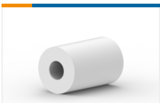
TE Part #2295225-1 THERMOCOUPLE CONN K-TYPE 2P. GROMMET