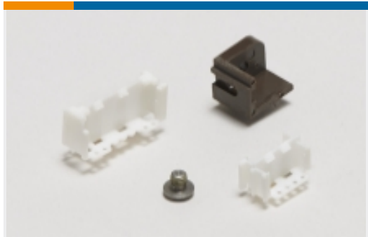
PCB Connector Mounting(2)