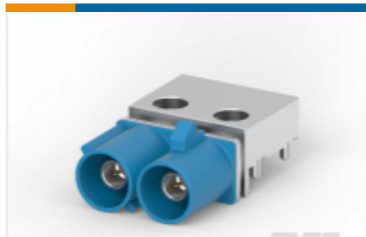
TE Part #5-2287923-3 FAKRA, 2 POS, EXT-EDGE, ASSY 12 O'CLOCK