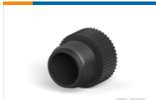
TE Part #2823064-1 M12-DUST CAP-FEMALE CONN-IP67-W/O SLEEVE