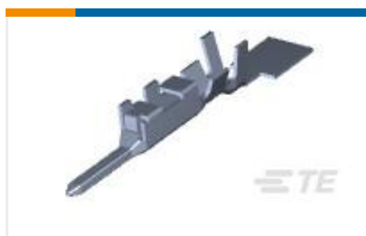
TE Part #1903116-2 DYNAMIC D1000 TAB CONT AU 0.38 um M L/P