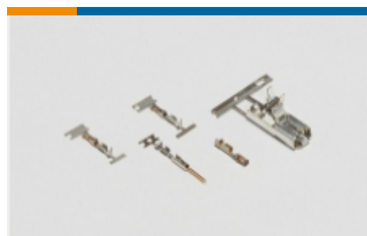
Wire-to-Board Connector Contacts(39)