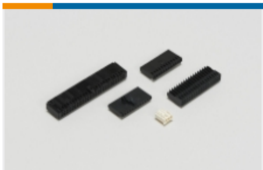
Wire-to-Board Connector Assemblies & Housings(157)