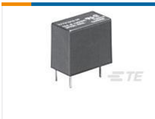
TE Part #2-1393194-1 T77V1D10-24