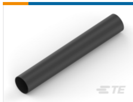
TE Part #NB25842001 SCL-3/8-0-STK