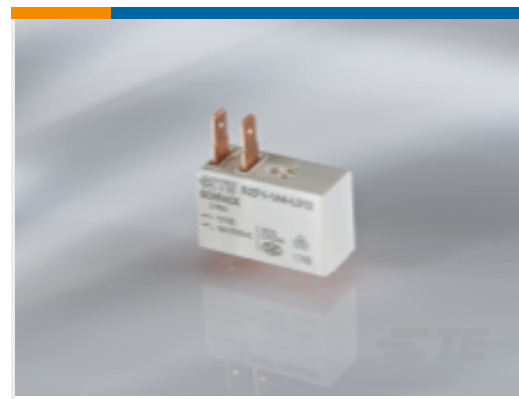
TE Part # 2-1833011-0 RZF1-1A6-L048