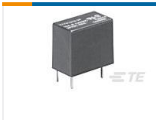
TE Part #1-1393194-9 T77V1D10-12