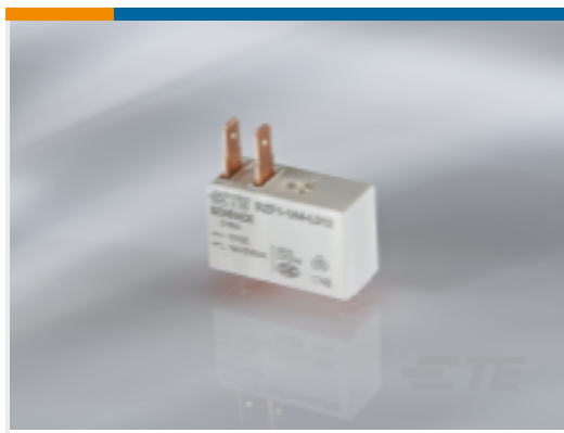
TE Part # 1833011-5 RZF1-1A4-L018