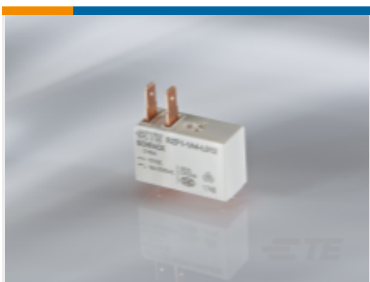
TE Part # 1-1833011-7 RZF1-1A6-L012