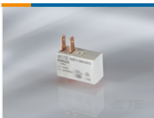
TE Part # 1-1833011-9 RZF1-1A6-L024