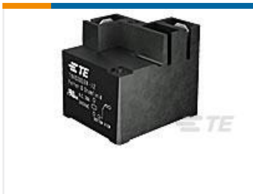
TE Part #4-1393210-0 T9AS5D12-9