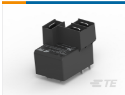
TE Part #1558676-7 T9GS1L24-24