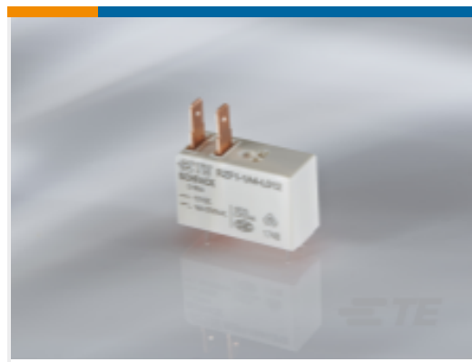
TE Part # 1833011-6 RZF1-1A4-L024