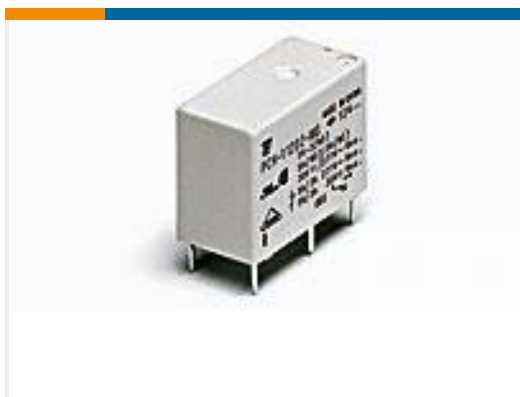
TE Part #1461350-6 PCH-124D2M,000