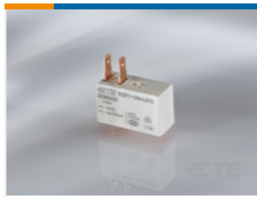
TE Part # 1833011-7 RZF1-1A4-L048