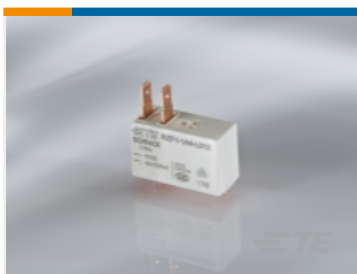
TE Part # 1833011-3 RZF1-1A4-L009