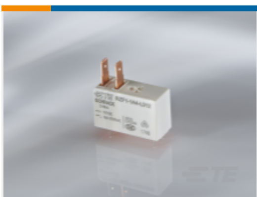
TE Part # 1833011-2 RZF1-1A4-L006