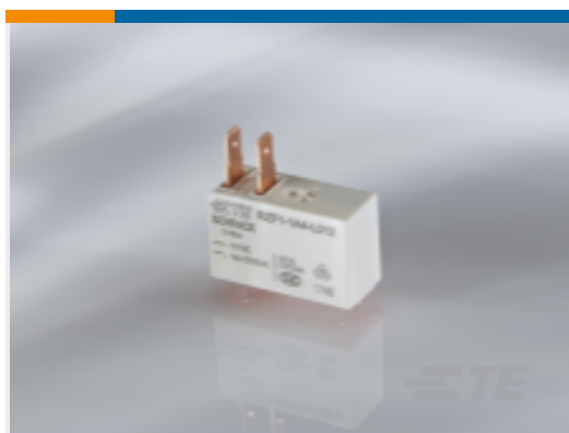
TE Part # 1-1833011-8 RZF1-1A6-L018