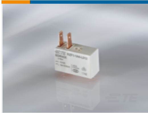
TE Part # 2-1833011-8 RZF1-1A6-L005