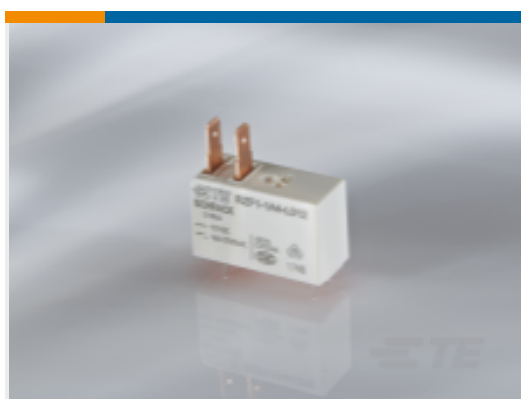
TE Part # 1833011-1 RZF1-1A4-L005