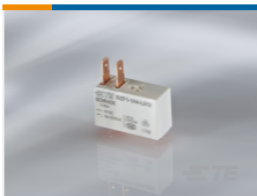
TE Part # 1-1833011-6 RZF1-1A6-L009