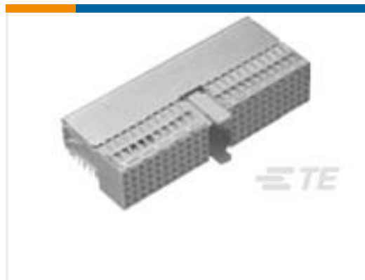
TE Part #100147-1 Z-PACK/A F-HDR.110P