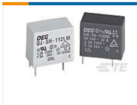
TE Part #5-1419144-3 OJE-SS-109LMH,000