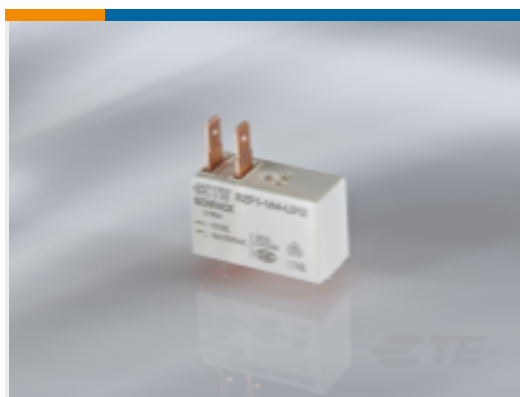
TE Part # 1-1833011-5 RZF1-1A6-L006