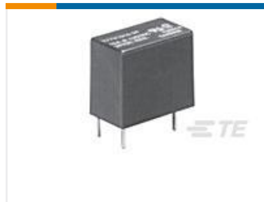
TE Part #2-1393194-7 T77V1D3-24