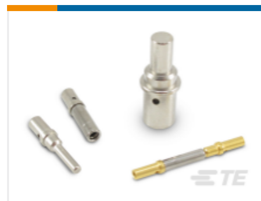
TE Part #0462-201-16141 DEUTSCH Solid Contacts