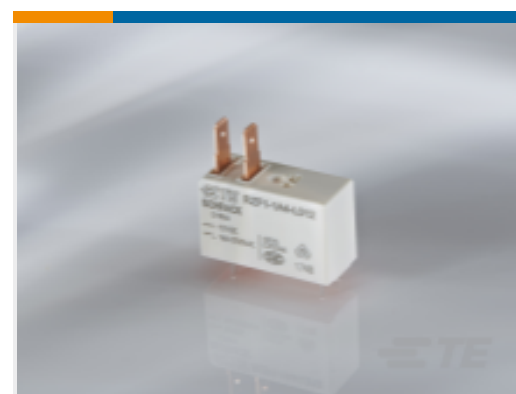
TE Part # 1833011-2 RZF1-1A4-L006