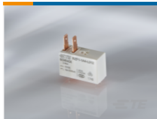
TE Part # 2-1833011-8 RZF1-1A6-L005