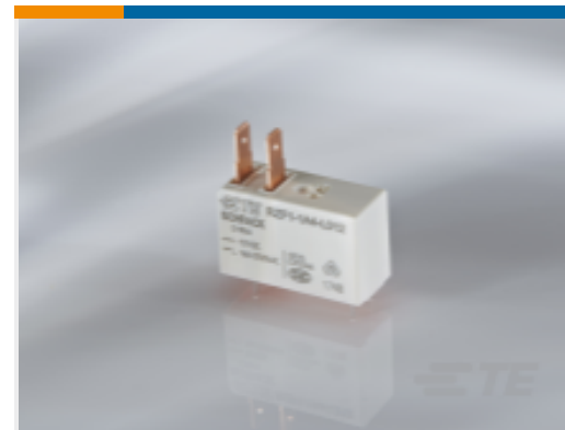
TE Part # 1-1833011-7 RZF1-1A6-L012