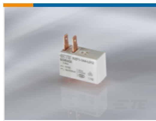
TE Part # 1833011-6 RZF1-1A4-L024