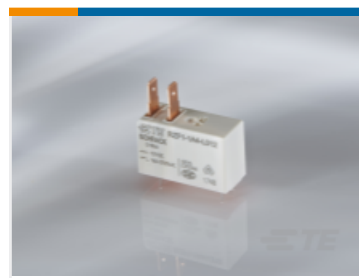
TE Part # 1833011-7 RZF1-1A4-L048