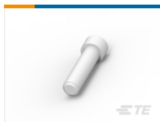
TE Part #114017-ZZ SEALING PLUG, SIZE 12/16, WHT