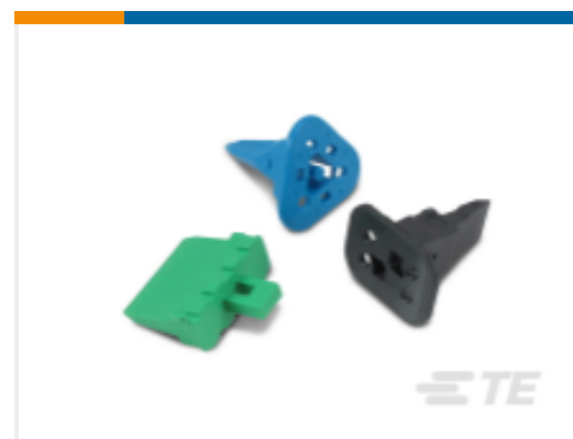
TE Part #W2S Wedgelocks: DEUTSCH DT