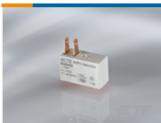
TE Part # 1-1833011-9 RZF1-1A6-L024