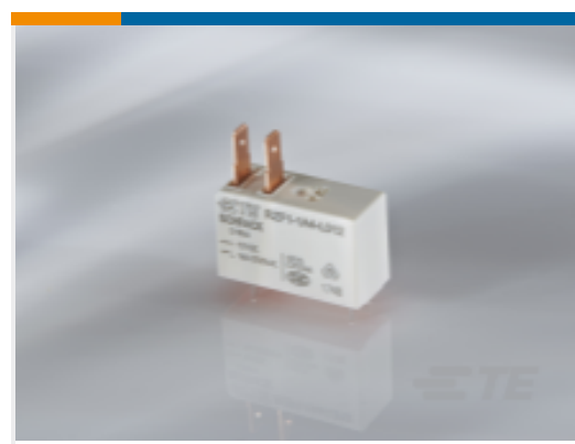
TE Part # 1833011-5 RZF1-1A4-L018