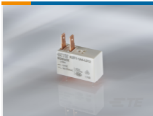
TE Part # 1-1833011-5 RZF1-1A6-L006