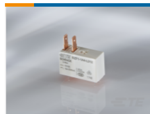
TE Part # 1833011-4 RZF1-1A4-L012