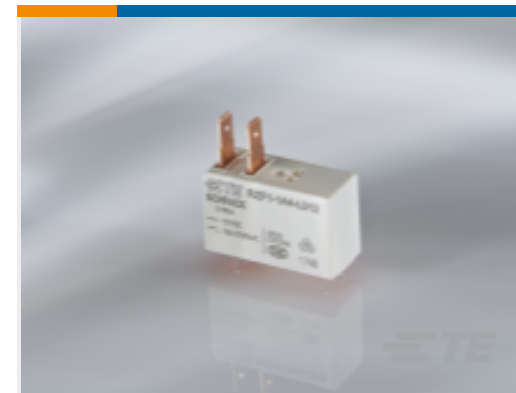
TE Part # 1-1833011-8 RZF1-1A6-L018