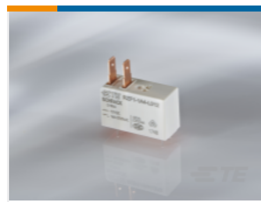
TE Part # 2-1833011-0 RZF1-1A6-L048