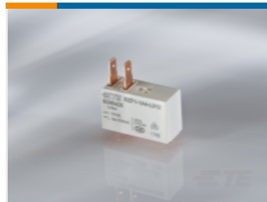
TE Part # 1-1833011-6 RZF1-1A6-L009