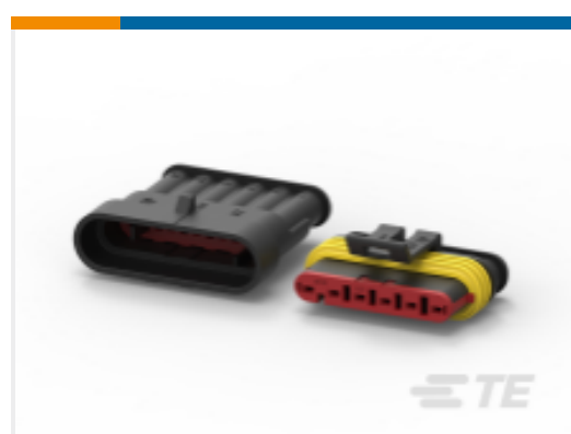
TE Part #282080-1 AMP SUPERSEAL 1.5MM, CONNECTOR HOUSING