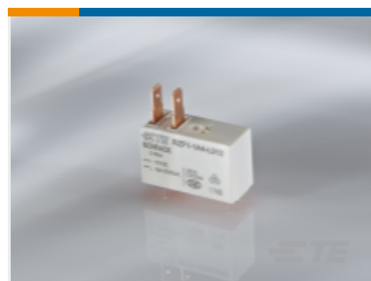
TE Part # 1833011-1 RZF1-1A4-L005