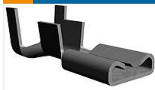
TE Part #63596-1 187 FASTON REC 18-14 AWG BR