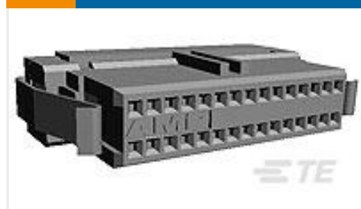
TE Part #2-111196-5 010 RCPT SYSTEM 50 30 DPLX