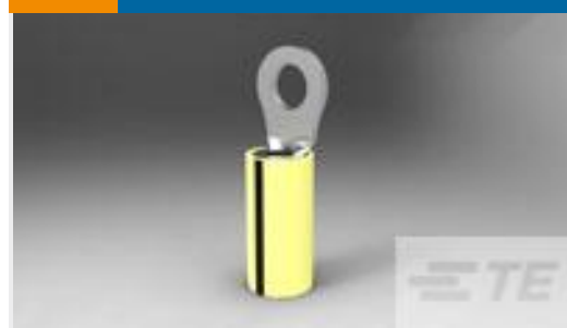
TE Part #35363 TERMINAL,PIDG R 16-14HD 10