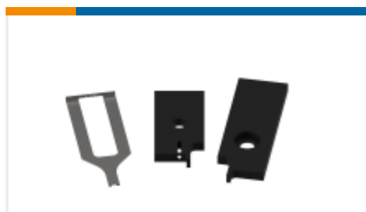
TE Part #2119757-1 DEPRESSOR, SHEAR