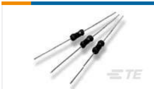
TE Part #4-1625886-2 1W SM M/OX 5% 820R