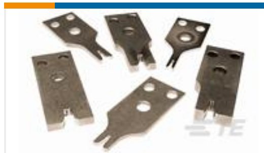
TE Part #1633860-3 CRIMPER, WIRE F