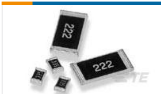
TE Part #9-1879494-7 CRGH0603 5% 10K 0.2W