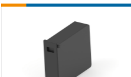
TE Part #3-1437602-1 SMCL=replaces SMCBG