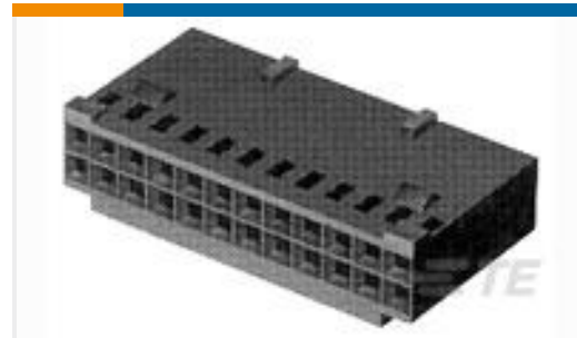
TE Part #2-87631-9 34 MODIV HSG COMP DR .100 POL