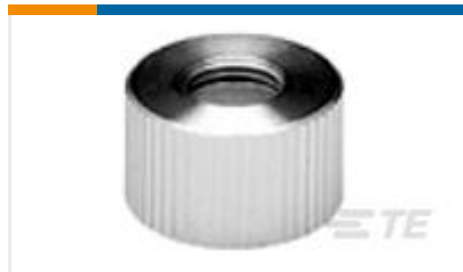
TE Part #8-1437627-4 G12KA=BUTTON GUARD KNURL ALUM