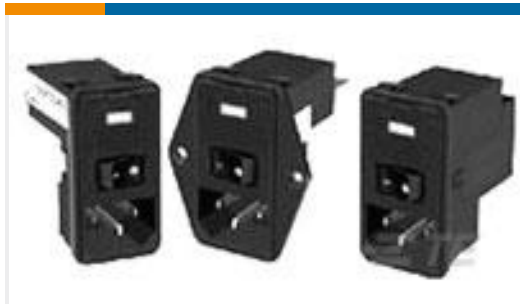
TE Part #6609108-5 PE0S0DZXC M0=C7043