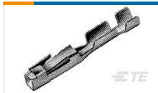
TE Part #5531216-2 T/SPRING LP