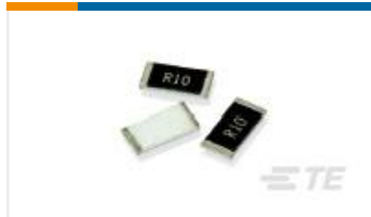
TE Part #3-1879463-4 RL73H 2E R24 1% 1K RL