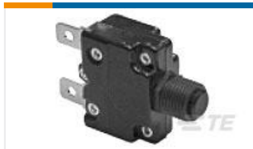
TE Part #9-1423364-7 W57-XB1A7A10-10=CKTBKR, THERM, PB, SCW/QC