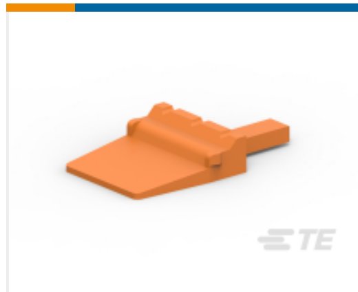
TE Part #WM-3P WEDGE LOCK, 3P, REC, ORG, DTM