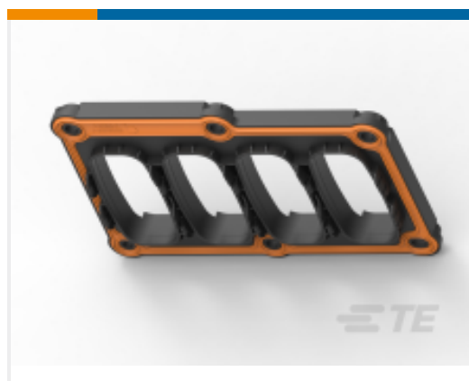
TE Part #2098891-2 4 bay mounting frame assembly