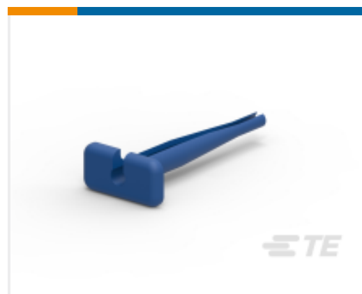
TE Part #0411-204-1605 EXT TOOL, SIZE 16, 16-18 AWG, N, DRK BLU