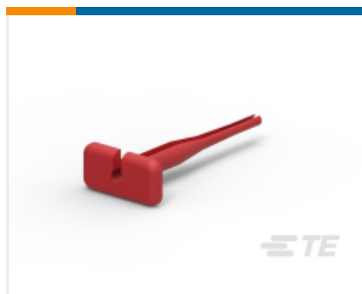
TE Part #0411-240-2005 EXT TOOL, SIZE 20, 16-22 AWG, N, RED