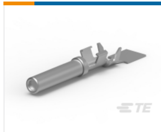
TE Part #1060-16-0622 DEUTSCH Size 16 Crimp Contacts