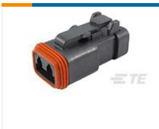
TE Part #DT06-2S-CE05 PLG, 2P, BLK, E, SEAL RET, CAP