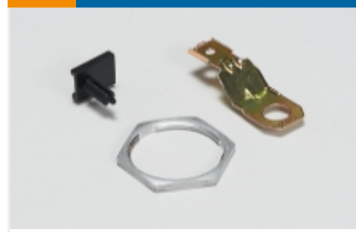
Other Automotive Connector Accessories(15)