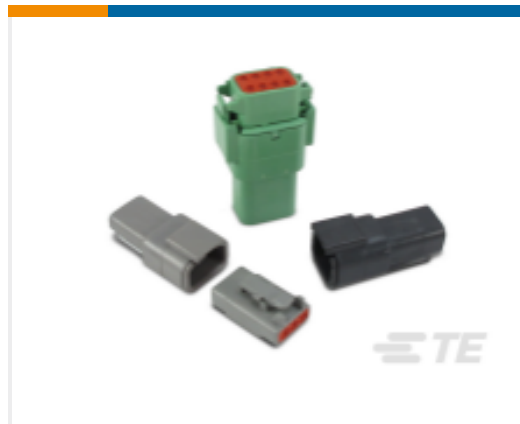
TE Part #DTM04-4P-E003 DEUTSCH DTM Housings