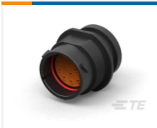
TE Part #HDP24-18-14PN-L017 REC, 14P, BLK, N, RNG, 16, P