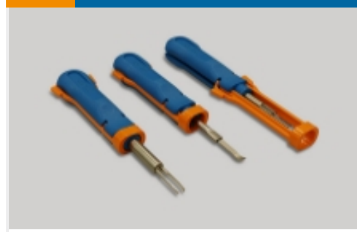
Insertion & Extraction Tools(5)