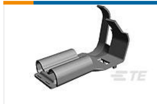
TE Part #175057-2 250 PL EX FLAG REC. 18-12AWG PTBR