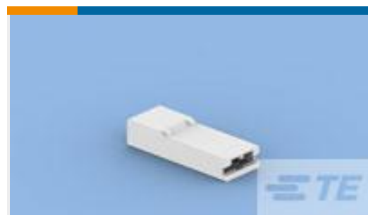
TE Part #1-2133346-0 250 FASTON HSG.,REC.,1 POS, NATRUAL