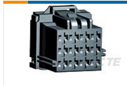
TE Part #4-968972-1 MCP2,8 GEH ASSY 12P