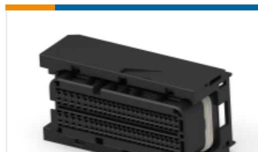
TE Part #2359941-1 96POS,MCON-1.2 CB,REC HSG,ASSY