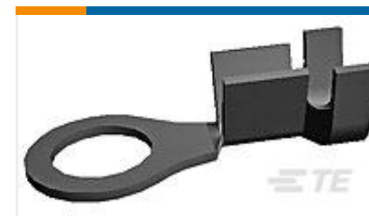
TE Part #444026-1 RING TONGUE ANTI ROTATIONAL 1- 5 MM2 BR