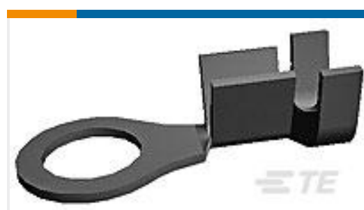
TE Part #626279-1 RING TONGUE 0.5-1.50 MM2 PLAINNUBR