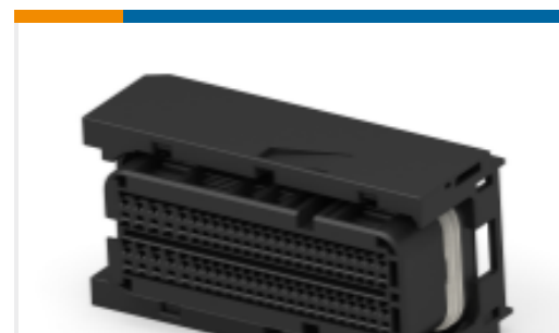
TE Part #2359943-2 96POS,MCON-1.2 CB,REC HSG,ASSY