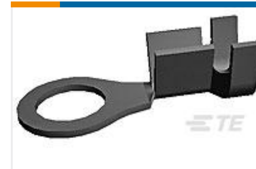
TE Part #626036-2 RING TONGUE TERMINAL 4.0-6.0 MM2 TPBR