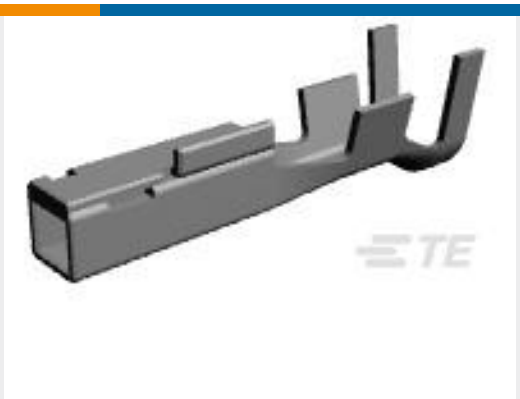
TE Part #1565079-1 GRACE INERTIA 3.5 REC CONTACT(L)