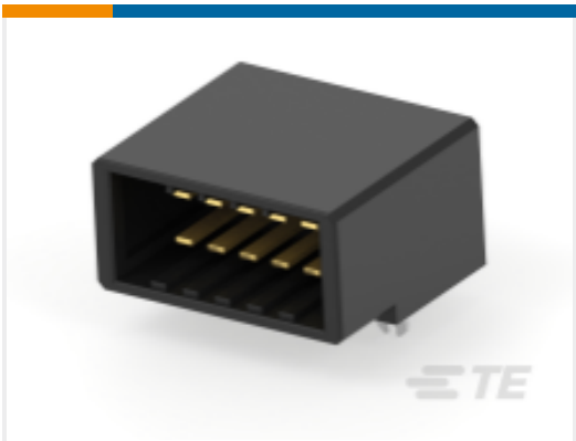
TE Part #178328-5 Header Assembly: Wire-to-Board, 15A, gold or tin plated