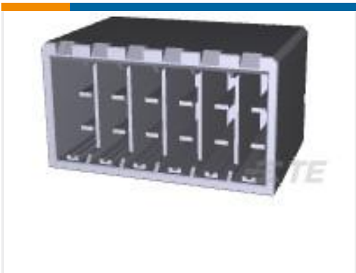
TE Part #316516-5 DYNAMIC 3500 HDR ASSY 12P V