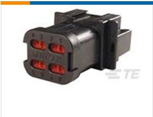
TE Part #DT04-08PB-CE01 REC, 8P, BLK, E, CAP, B