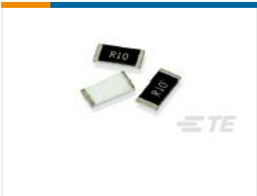
TE Part #2176057-8 RLP73V 3A R020 1% 1K RL