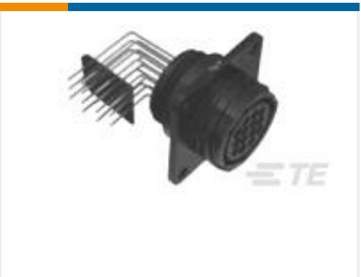
TE Part #1-796375-1 CPC PSTD RCPT,13-9,R/A LF