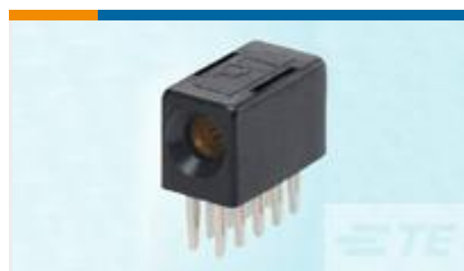
TE Part #6643220-1 SLIMLINE,ICCON,SKT,ASSY