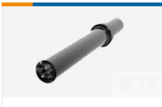
TE Part #1648325-1 702-92-01109=CONTACT,SKT,#20