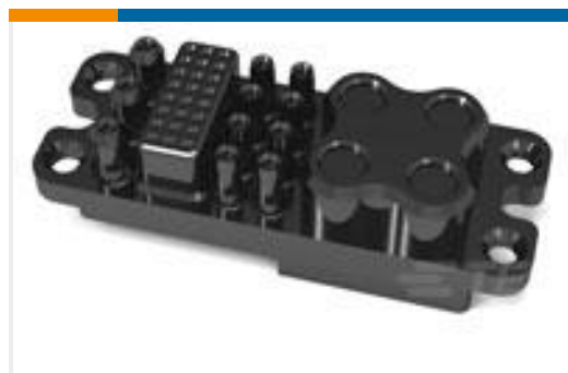
TE Part #1648578-1 296-0049-01100