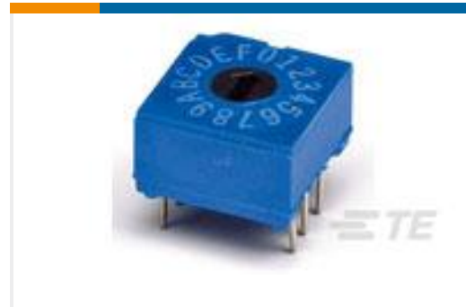
TE Part #1825008-3 DRD16CRAE04=Rot Dip,R/A,w/comp