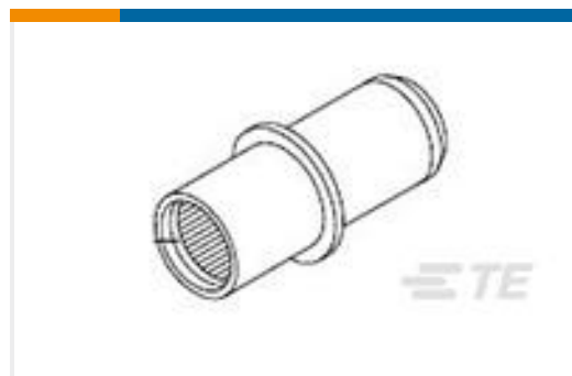
TE Part #6648416-1 CONTACT,SKT,SIZE #0