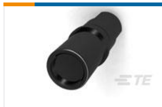
TE Part #6648335-1 CONTACT,SKT