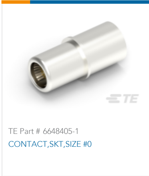
TE Part # 6648405-1 CONTACT,SKT,SIZE #0