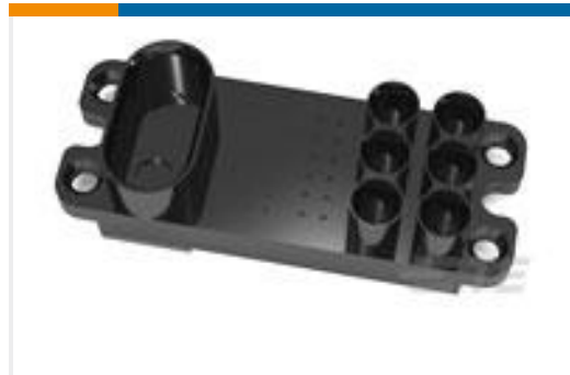
TE Part #1648183-1 291-10-01100=SA CONN,PIN