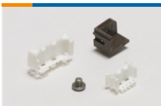
PCB Connector Mounting(1)