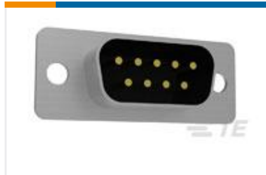
TE Part #5-747904-2 9 Plug Solder Cup, Gold Flash,